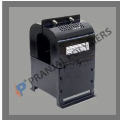
SS Coupling Guards