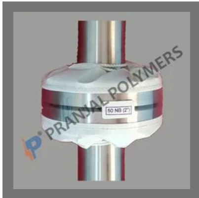
PTFE Coated Fiberglass Flange Guards With Transparent Window