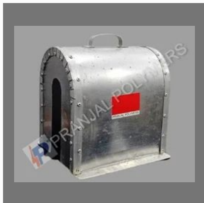
Aluminum Coupling Guards