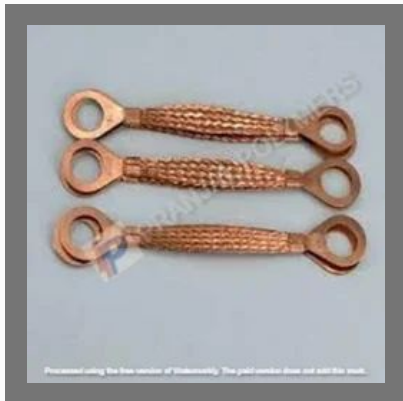
Copper Laminated Jumper