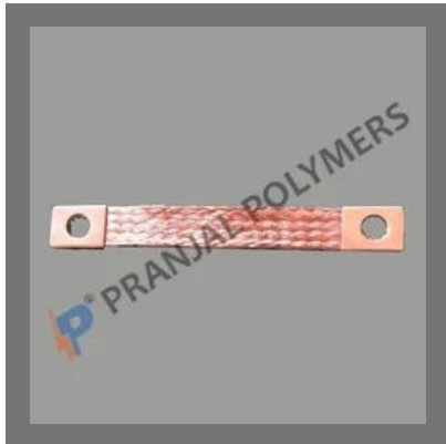
Copper Braided Earthing Jumpers