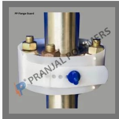
PP Flange Guard