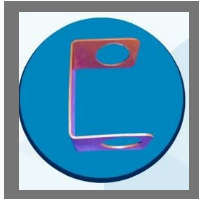
Copper Earthing Jumper