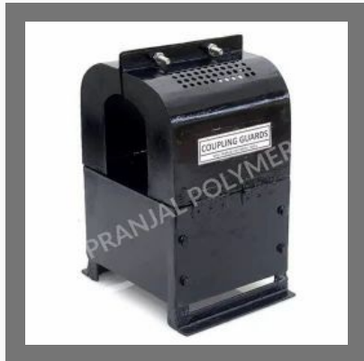
MS Coupling Guard