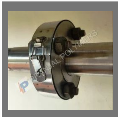
SS 304 Strips Type Flange Guards With Easy Lock