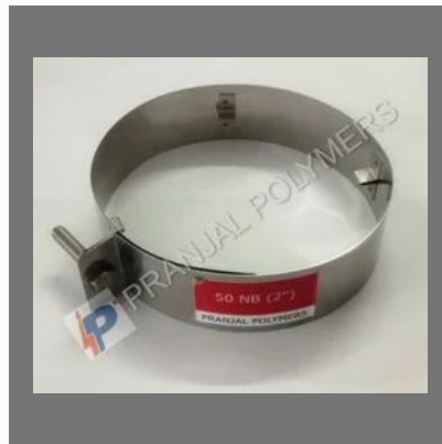
SS 304 Stripes Type Flange Guards With Notch