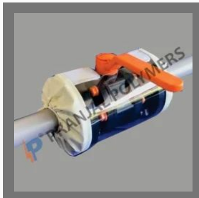
PVC Valve Guards