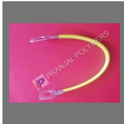
Copper Wire Type Jumper