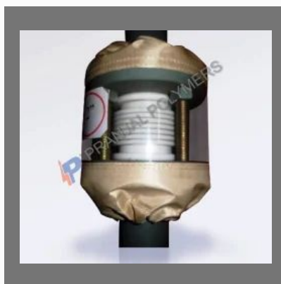
PTFE Below Guards