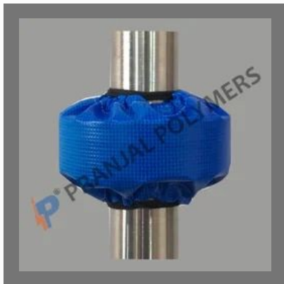
PVC Flange Guard