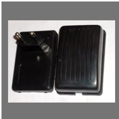
Smgs Adaptors Casing.