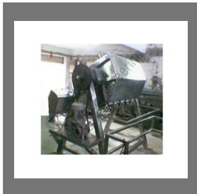
Octagonal Blender for Chemical Industry