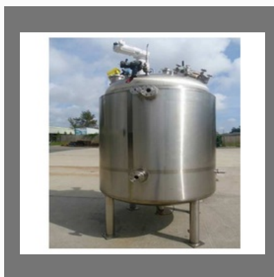
Jacket Reactor Gmp