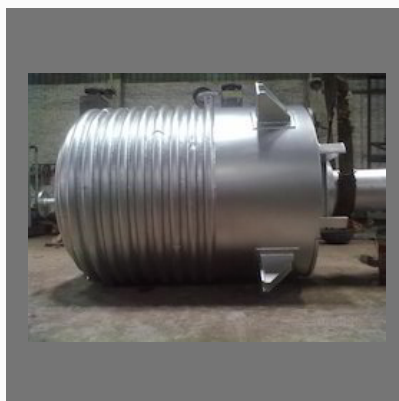
External Half Coil Reactor