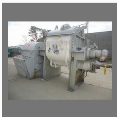
Sigma Mixer Extruder