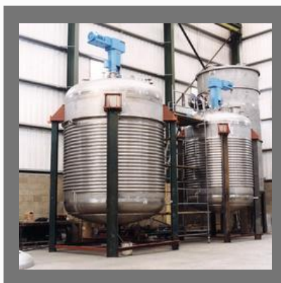
Limpet Coil Reactor Vessel