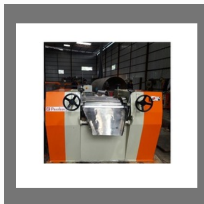
Triple Roll Mill