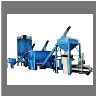
Road Making Paint Plant