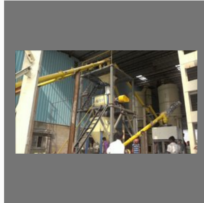
Dry Mix Mortar Plant