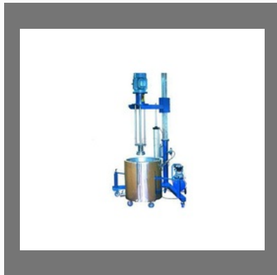
Pneumatic Speed Shear Emulsifier