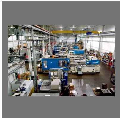
Paint Manufacturing Plant