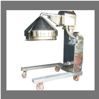
Umbrella Type Dryer