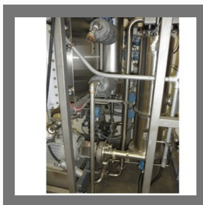
Portable CIP System