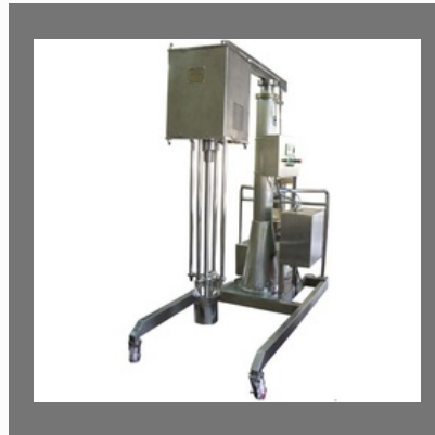
High Speed Shear Emulsifier