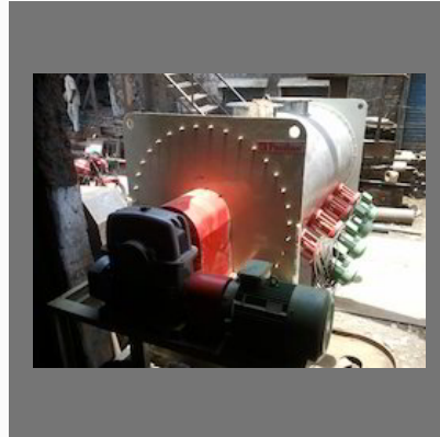
Plough Shear Mixer