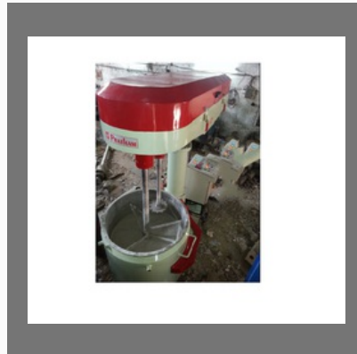
Twin Shaft Disperser