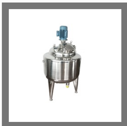
Mixing Tank Homogenizer