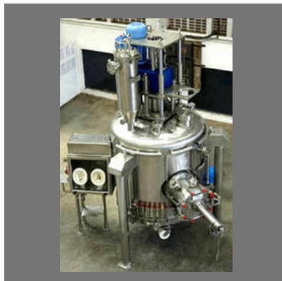
Agitated Nutsche Filter