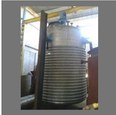
Limpet Coiled Reactor