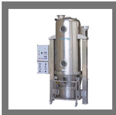
Fluidized Bed Dryer