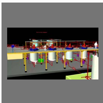
Lube Oil Plant