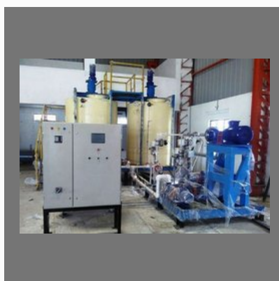
Bitumen Emulsion Plant