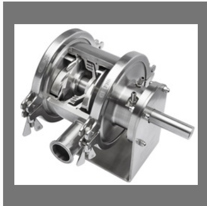
Manual High Speed Shear Emulsifier