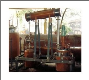
Non GMP Resin Plant