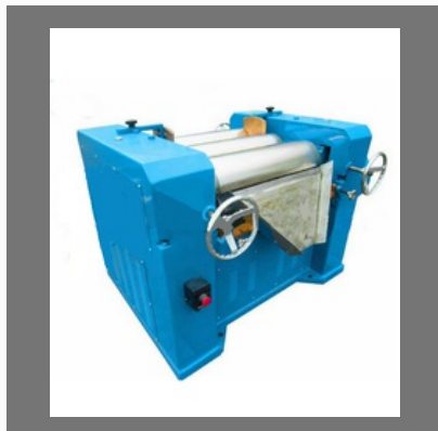
Three Roll Mill