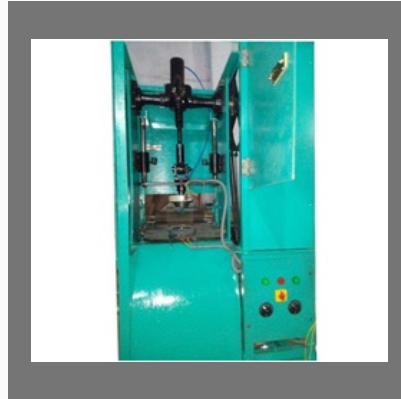
Dual Shaft Disperser