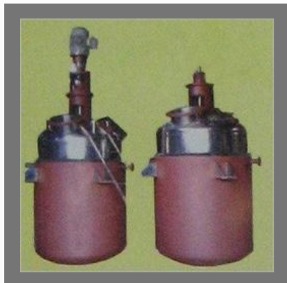
Non GMP Reactor