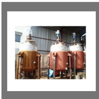
Jacket Non GMP Reactor