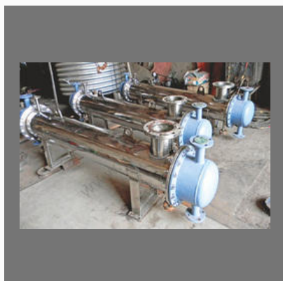
Condenser Heat Exchanger