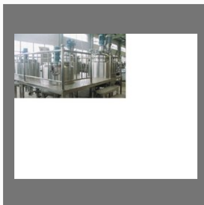
Planetary Mixer For Defence