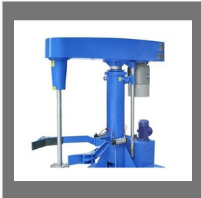
High Speed Lifting Disperser