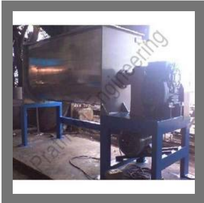
Horizontal Ribbon Mixer