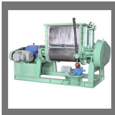
Sigma Mixer with Extruder Screw