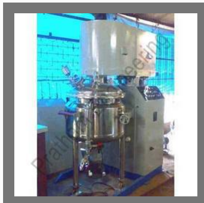
Contra Chem Fab Machine