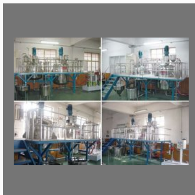
Paint Plant Machines