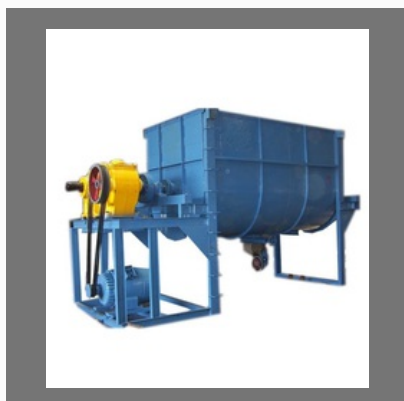
Rotary Drum Blenders