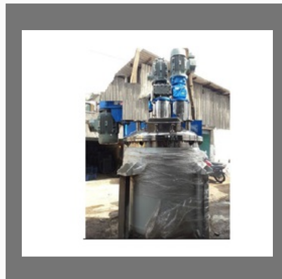
Twin Shaft Dispensers