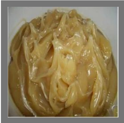
Mivan Shuttering Grease Grade I