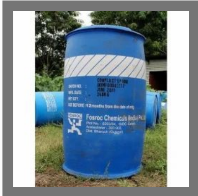
FOSROC REEBOL OIL BASE SHUTTERING OIL