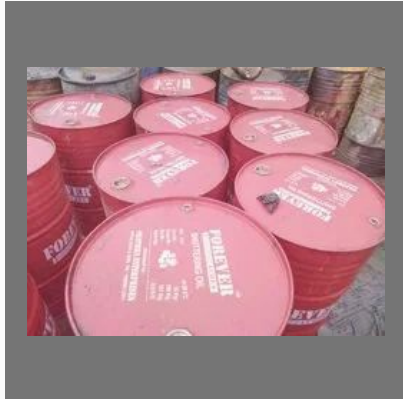
Forever Lubes Shuttering Oil