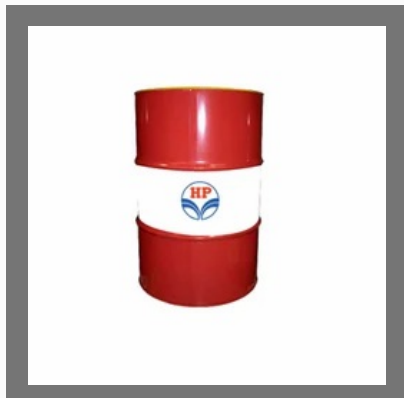
HPCL Enklo 68