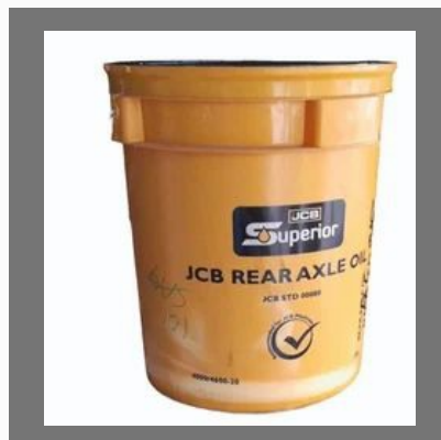
Jcb Rear Axle Oil