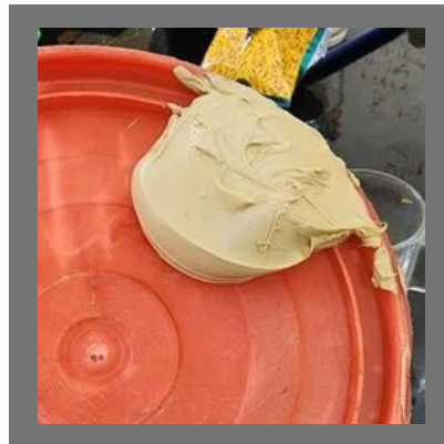
Mivan Shuttering Grease