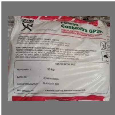
Fosroc Conbextra Gp2n