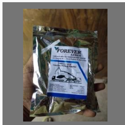
Forever Lubes Concrete Pump Primer Slurry Pouch