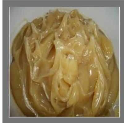
Aluminium Shuttering Grease