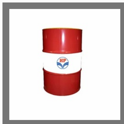
Hp Lubricating Oil Enklo 68 Hydraulic Oil