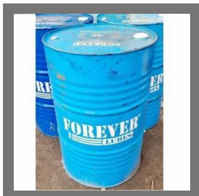
Mivan Shuttering oil