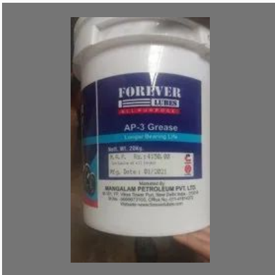
Forever Lubes Shuttering Grease