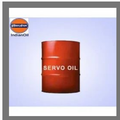
Servo System 68/32/46