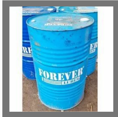
Forever Lubes Mivan Shuttering Oil