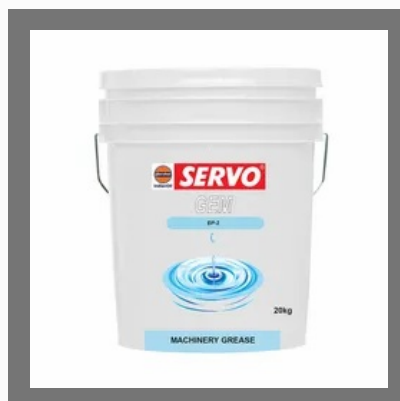
Indian Oil Servo GEM EP 2 Machinery Grease, Size: 20 Kgs