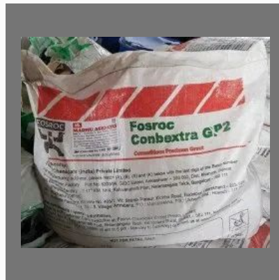
Fosroc Conbextra Gp2 - Grouting Material