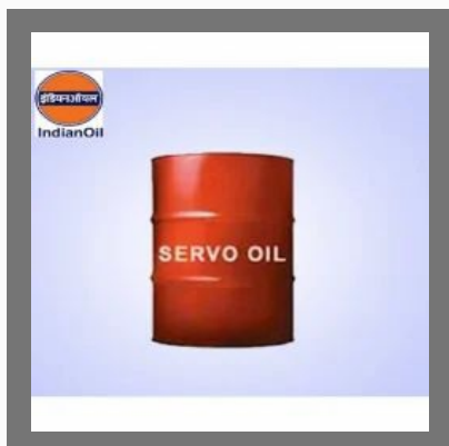
Servo 46 Hydraulic Oil