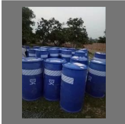
Fosroc Curing Compound For Industrial, Grade Standard: Bio-Tech Grade