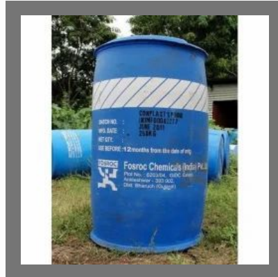
Water Based Concrete Curing Compound