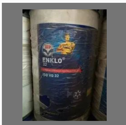
HP Enklo 32 Hydraulic Oil