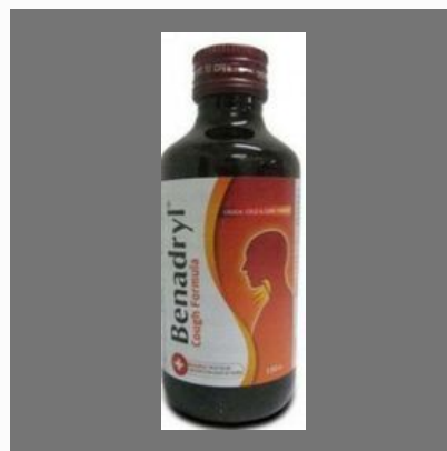
Benadryl C Formula Syrup