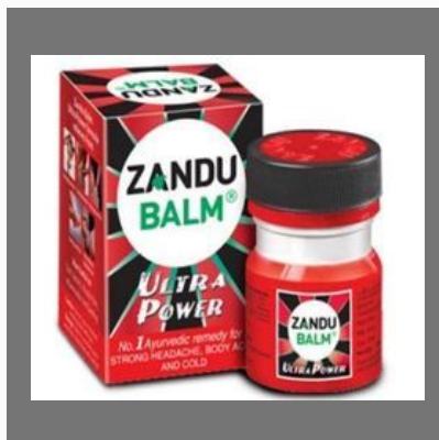
Balm Ultra Power