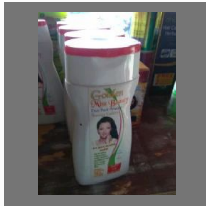
Face Bleaching Powder