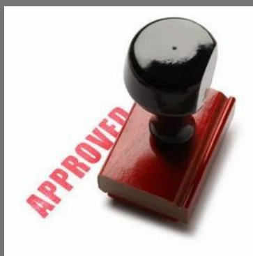
Pharma Registration Services