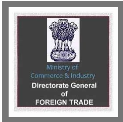
DGFT Documentation Service