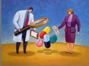
Regulatory Affairs Services