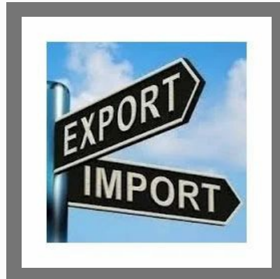
DGFT Licensing Service