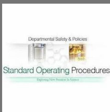
Standard Operating Procedure (SOP) Services