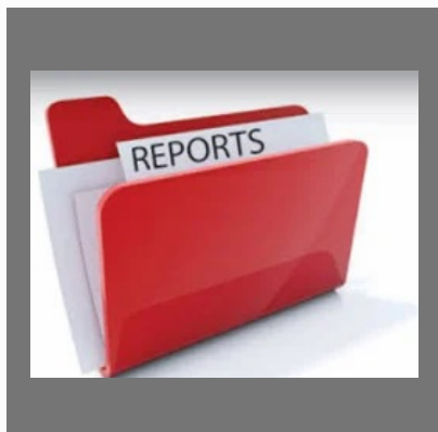
Pharmaceutical Development Report Service