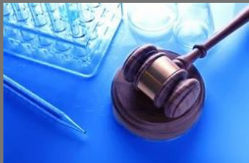
Pharma Regulatory Services