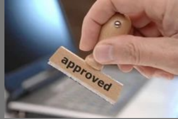
Regulated and Emerging Market Services