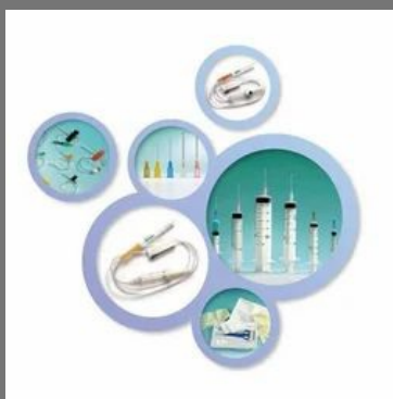
Medical Devices Regulatory Affairs Services