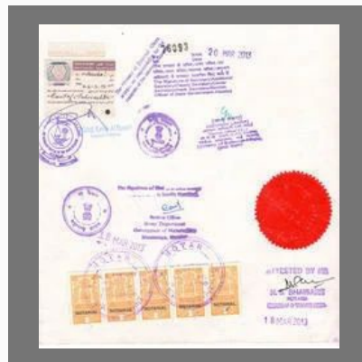
Embassy Attestation Services