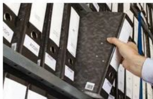
CTD/ACTD/Country-specific Dossier Services