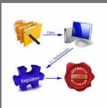
MOH Query Handling Management Consultancy Service