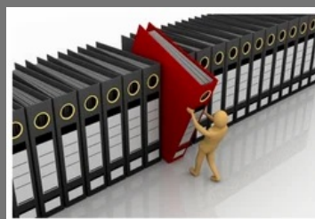
Drug Master File Documentation Service