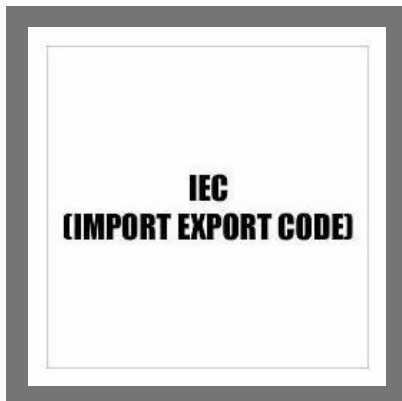
IEC Code Consultants