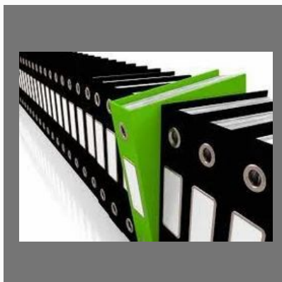
Site Master File Service