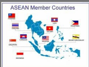
ASEAN CTD Dossier Services