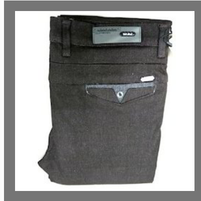
Mens Designer Pant