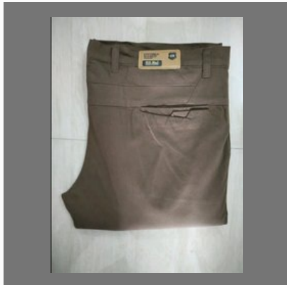
Men Formal Trouser