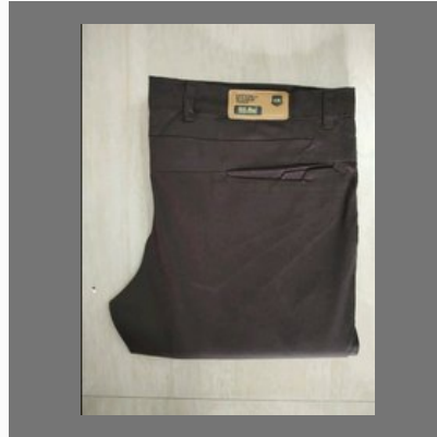
Mens Casual Trouser