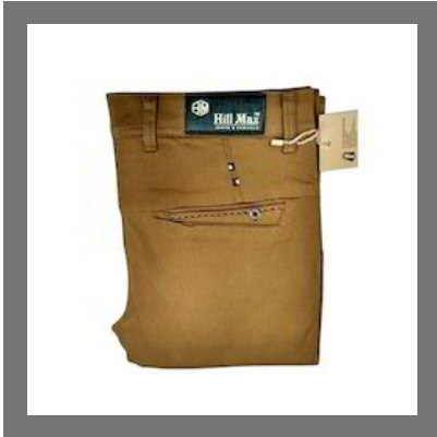
Mens Formal Pant