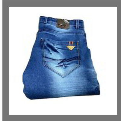
Designer Mens Jeans