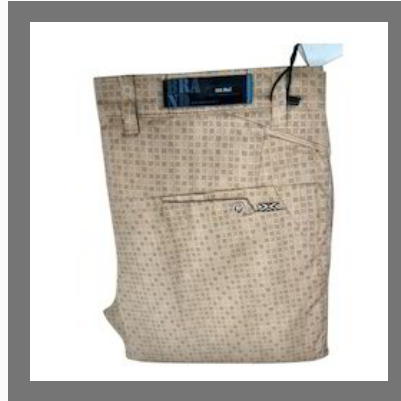
Mens Fashionable Pants