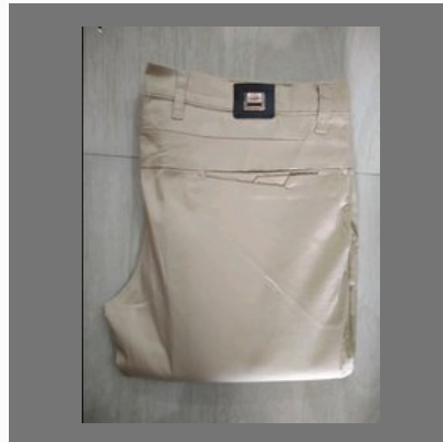
Men Formal Trouser