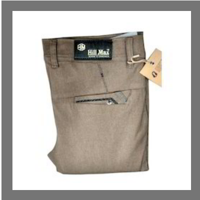
Mens Comfortable Pants