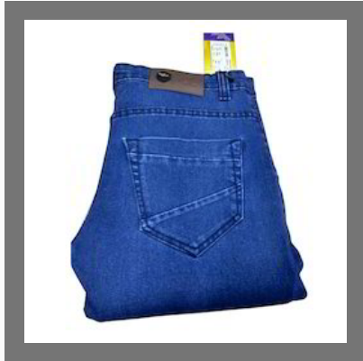
Mens Slim Fit Jeans