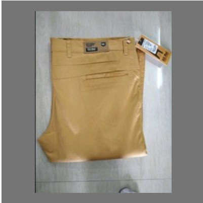
Mens Cotton Pant