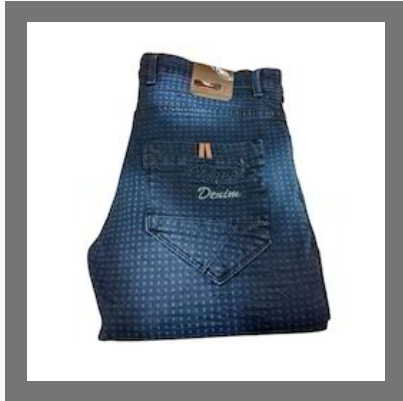
Mens Stretchable Jeans