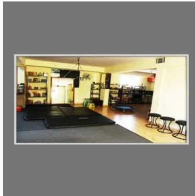
Downs Syndrome Occupational Therapy