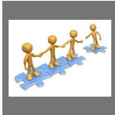
Corporate Law Consultancy