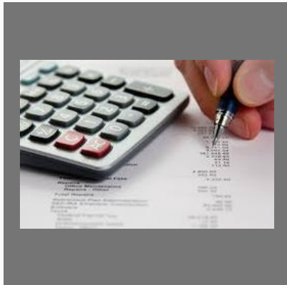
Bookkeeping & Accountancy