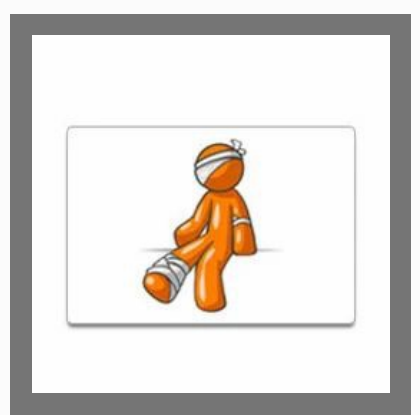
Leave Management Software