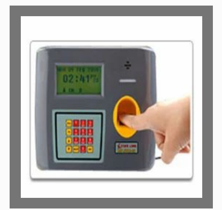
Access Control System