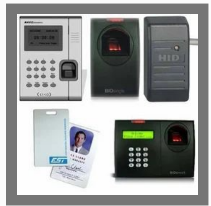
Door Access Control System