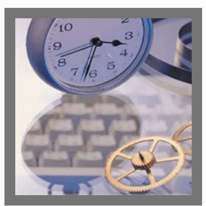
Prime Access Recording & Info System