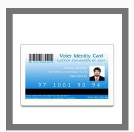
Plastic ID Cards