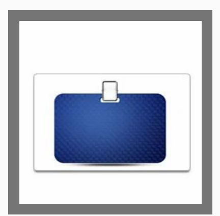
Plastic Identification Cards