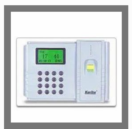
Fingerprint Access Control System