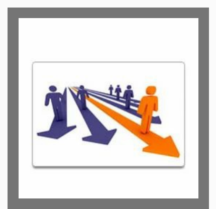
Performance Management System