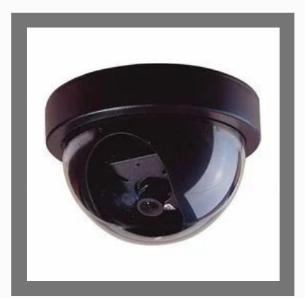
CCTV Dome Camera