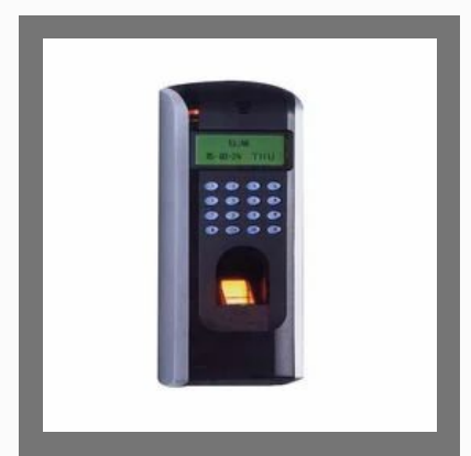
Finger Print Scanners