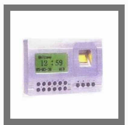
Biometric Access Control System