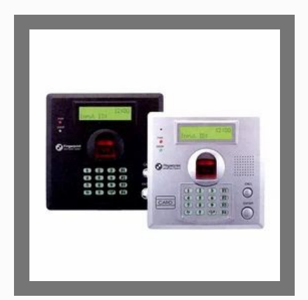
Finger Print Readers