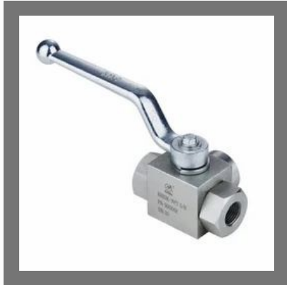
Stainless Steel Hydraulic Ball Valve