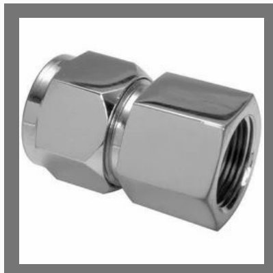
Stainless Steel Female Connector