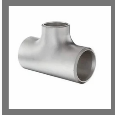
Stainless Steel Equal Tee