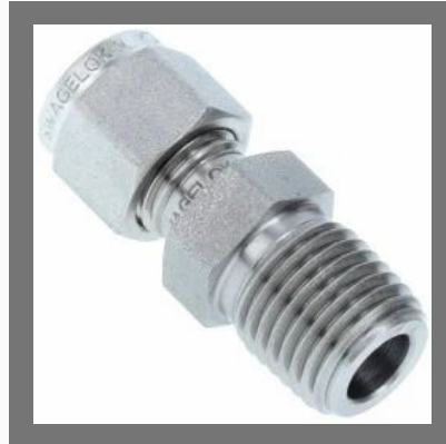
Double Ferrule Pipe Fittings