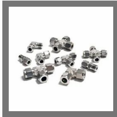
Stainless Steel HYDRAULIC FITTINGS