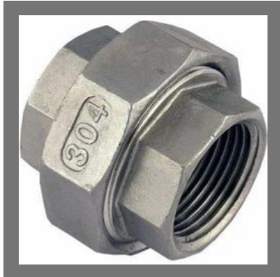
Stainless Steel Union