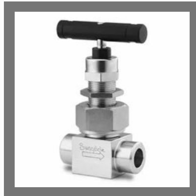
Stainless Steel Union Bonnet Needle Valve