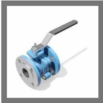
Stainless Steel SAE Flange Ball Valve