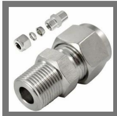
Stainless Steel Male Connector