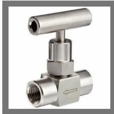
Stainless Steel Needle Valve