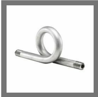
Stainless Steel M X F U-type Syphon