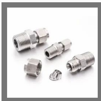
Double Ferrule Tube Fittings