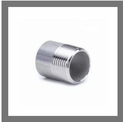
Stainless Steel Weld Nipple