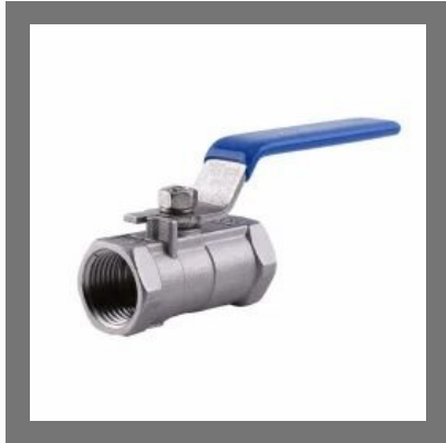
Stainless Steel Female Threaded Ball Valve