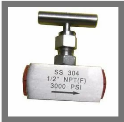
304 Stainless Steel Female Needle Valve