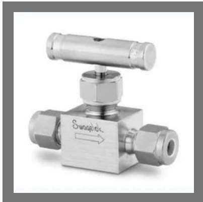
Stainless Steel Tube End Needle Valve