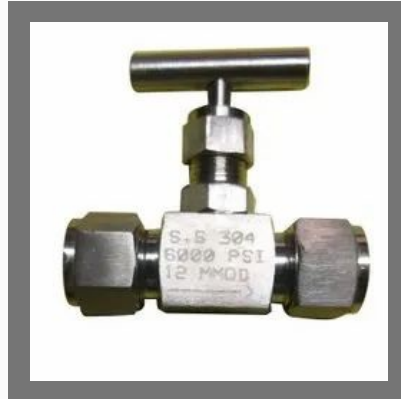
Ferrul Fitting OD Needle Valve