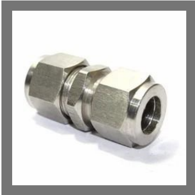
Stainless Steel Straight Coupling