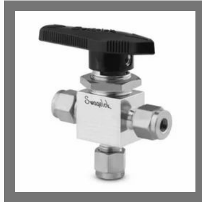
Stainless Steel 3 Way Panel Mounted B/V