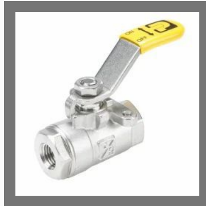
Stainless Steel Short Handle Ball Valve