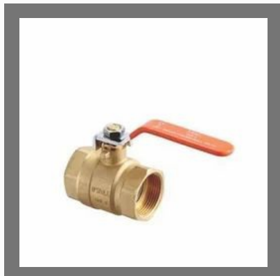
Stainless Steel Tube End Ball Valve