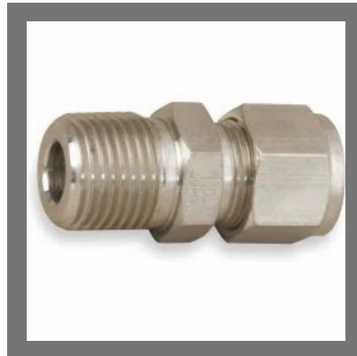
Double Ferrule Fittings