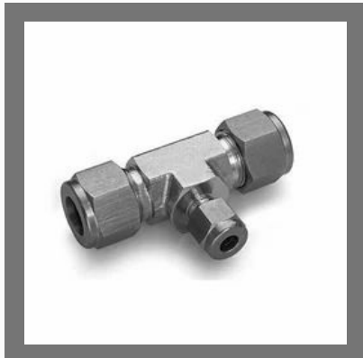
Stainless Steel Reducing Union Tee