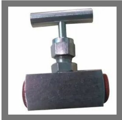
SS316 1 Inch Needle Valve