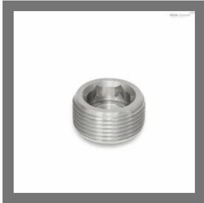
Stainless Steel Blanking Plug