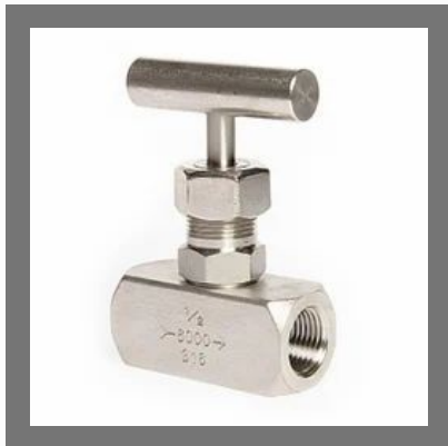
Stainless Steel Butt Weld End Needle Valve