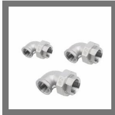
Stainless Steel Female Thread Adjustable Elbow