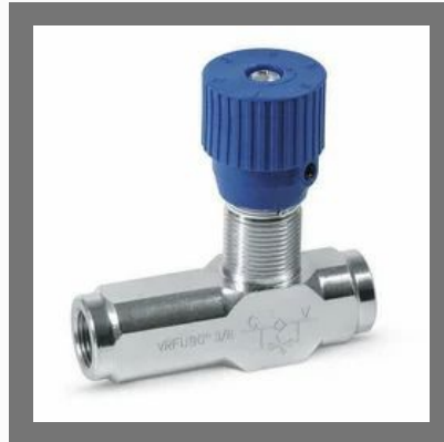
Stainless Steel Flow Control Valve