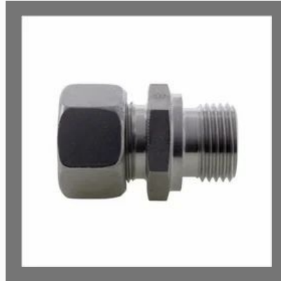
Stainless Steel Buttweld Stud Coupling