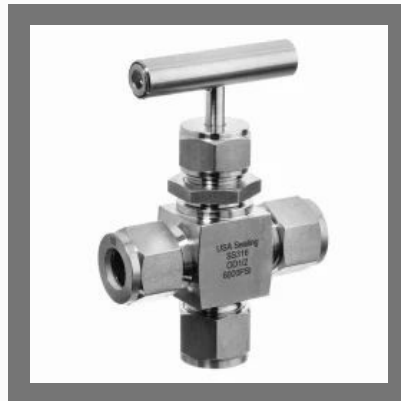
Stainless Steel 3 Way Needle Valve