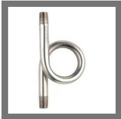
Stainless Steel M X F Q-type Syphon