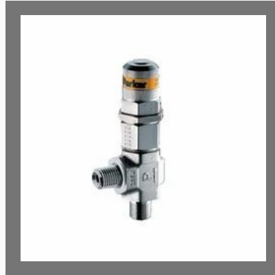
Stainless Steel Pressure Relief Valve