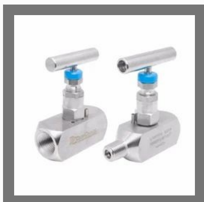
Stainless Steel 10000 PSI Needle Valve