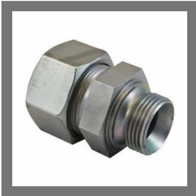
Stainless Steel Male Stud Coupling