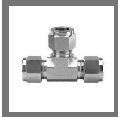
Stainless Steel Union Tee