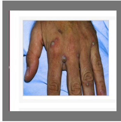
Immunocompromised Host Infectious Diseases