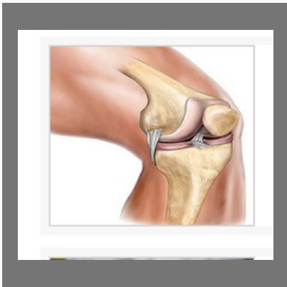
Bone And Joint Infections