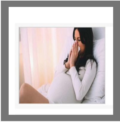
General Infectious Diseases