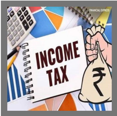
Income Tax Filing Service