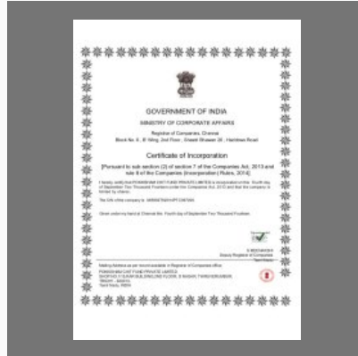
Company Registration Service