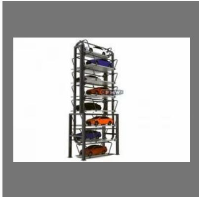
Rotary Car Parking System