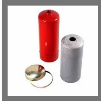
Fire Extinguisher Shell