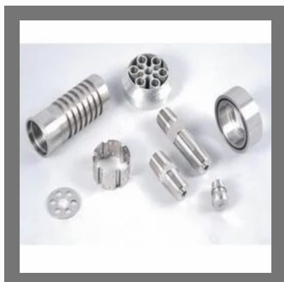
CNC Turning Component