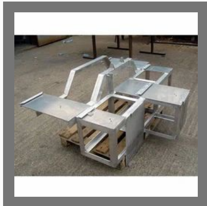
Aluminum Fabrication Service