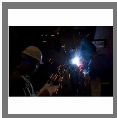
MIG Welding Service