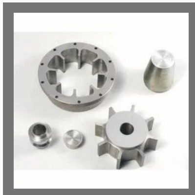
CNC Milling Component