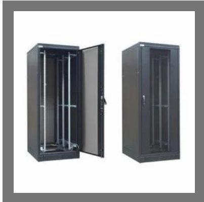
Network Server Rack