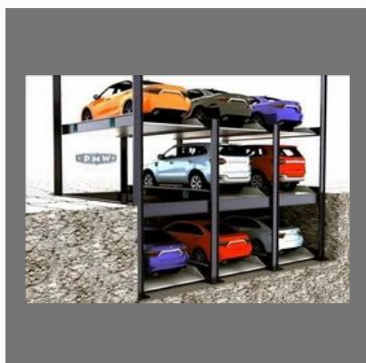
Hydraulic Pit Type Puzzle Car Parking System