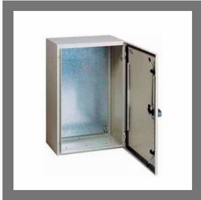
Wall Mounted Enclosure