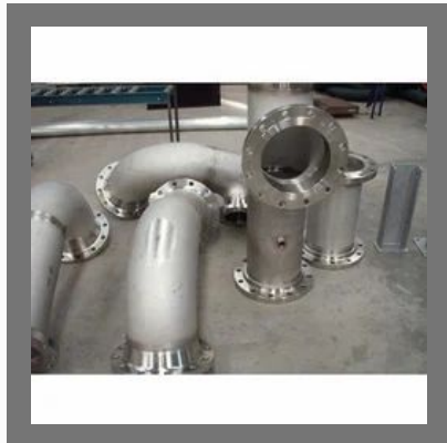
Pipe Fabrication Service