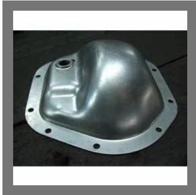
SS Gear Cover