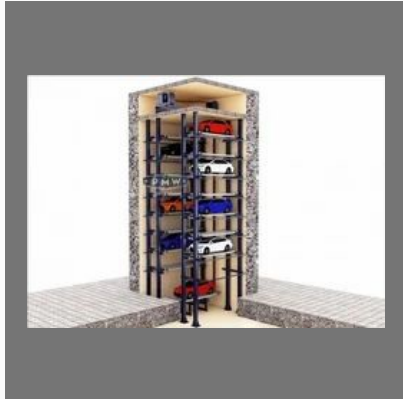
Tower Car Parking System