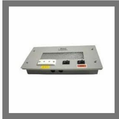
Fabricated Light Enclosure