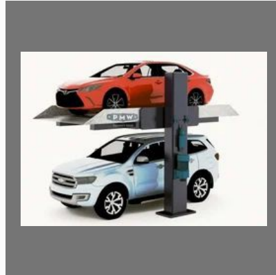
Single Pole Car Parking System