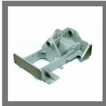
CNC Fabrication Service