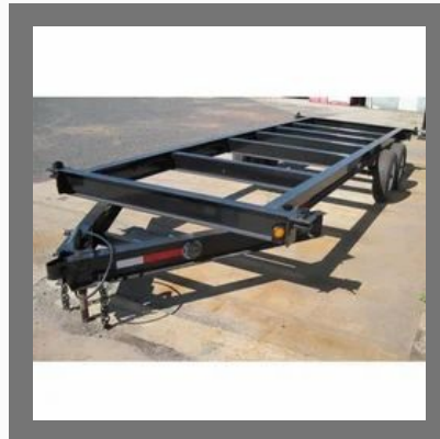
Trailer Fabrication Service