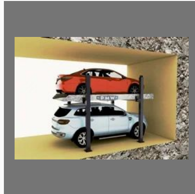
4 Pole Mechanical Stacker Car Parking System