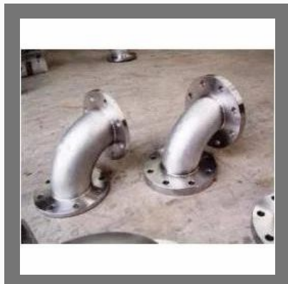
Aluminum Pipe Fabrication Service