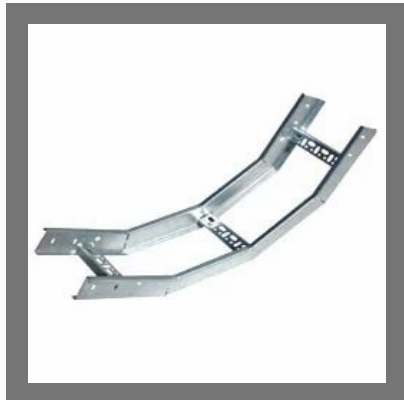
Aluminium Cable Tray