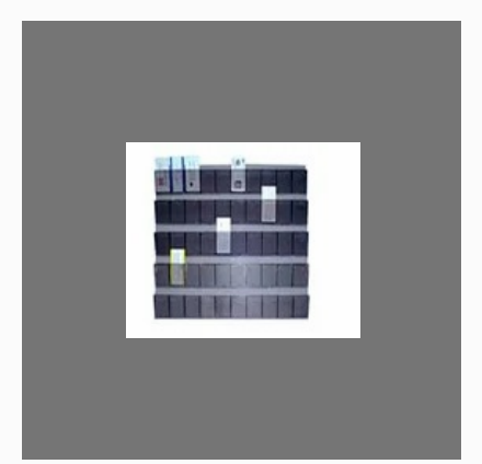
Acrylic Racks to Hold the Cards