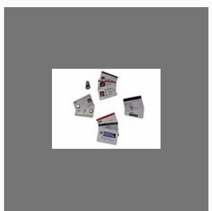
PVC Cards, Laminated Cards, Touch Tokens