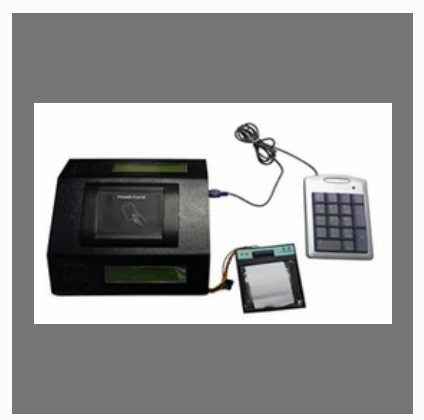
Canteen Management System