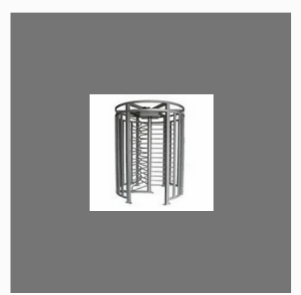
Full Height Turnstile