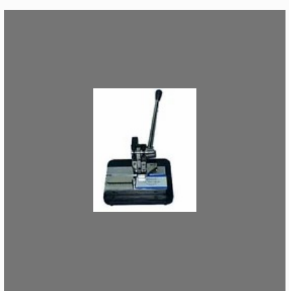
Card Punching Jig for Optical Cards