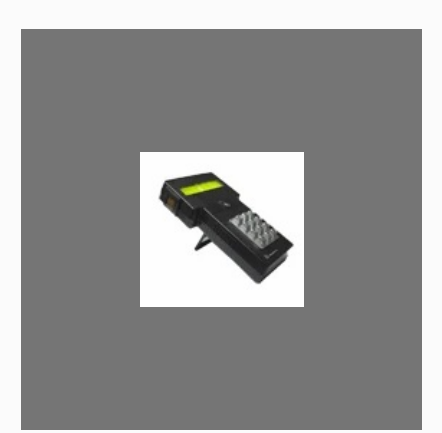
Portable Identification Devices