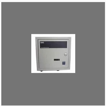
Building Management System