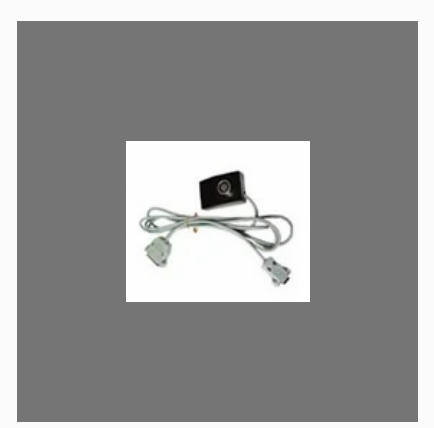
Token Programming Probe