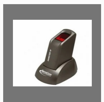
Computer Security Management