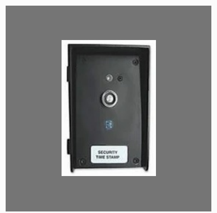
Guard Management System