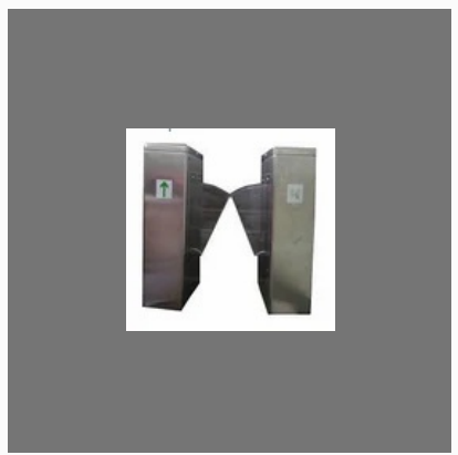
Flap Barrier Turnstile