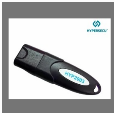
HyperPKI HYP2003 (ePass Auto 2003) FIPS USB Token FIPS 140-2 Level 3 Certified