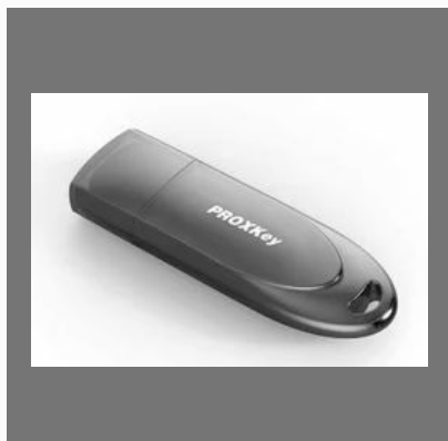
Watchdata Proxkey USB Smart Token