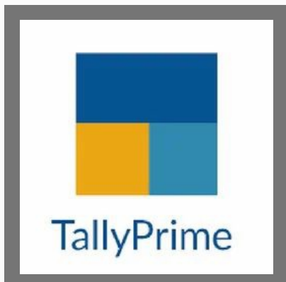
Tally Prime Silver Single User