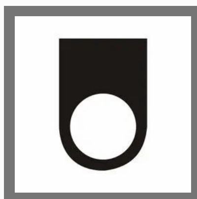
Aluminum Anodised Ring Label