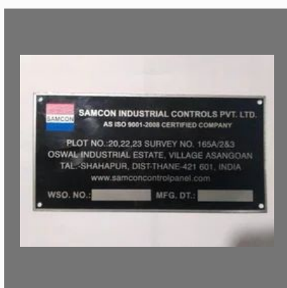
Aluminum Engraving Name Plate