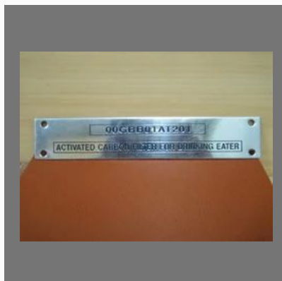
Stainless Steel Etched Label And Plates