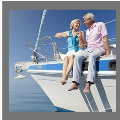
Wealth Management Services