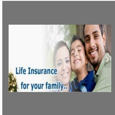
Specific Goal Based Financial Planning Services