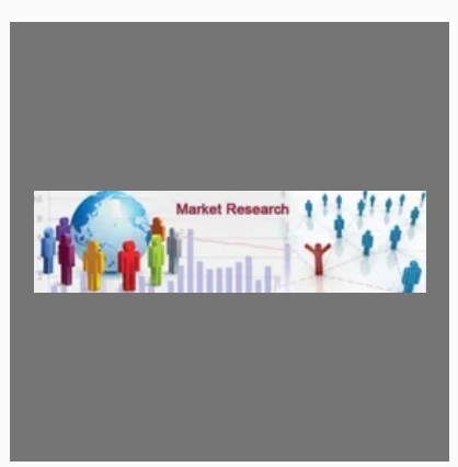
Market Research Service