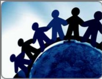
Product Promotion Service