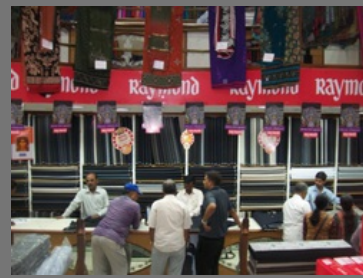
Event Management Service