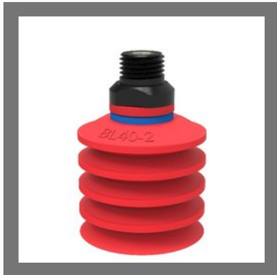
Vacuum Suction Cups - Bag Handling Suction Cups