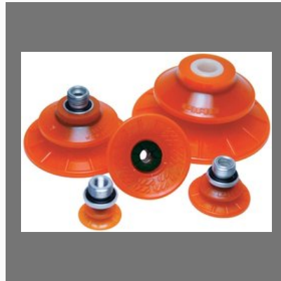
Sheet Metal (Oily) Handling Suction Cups