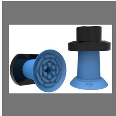
Bag Opening/Thin Paper - Slip Sheets/Film Suction Cups