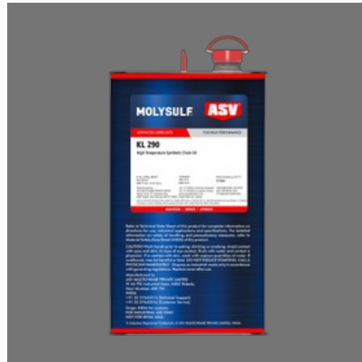
SYNTHETIC LUBRICATING OILS