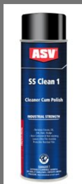
Stainless Steel Cleaner And Polish Spray - SS Clean 1