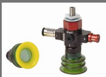
Combined Pump And Gripper VGS