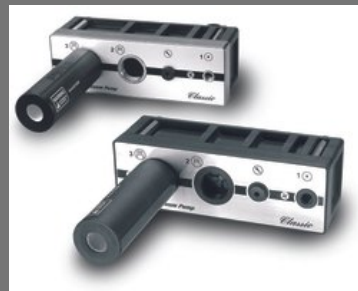
Chemical resistant Vacuum Pumps