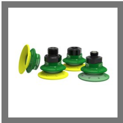
Sheet Metal (Dry) Handling Suction Cups