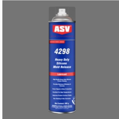
Silicone Lubricant Oil Spray