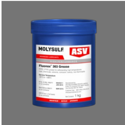
High Temperature Lubricant Grease