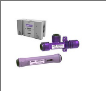
Value Line vacuum generators