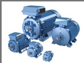
AC Motors IP Rating: IP55, 14000 RPM