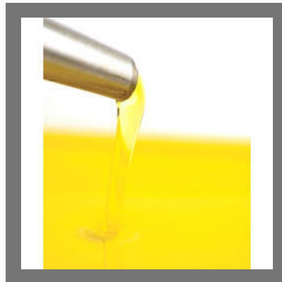
Gear, Hydraulic And Chain Oils - Food Grade