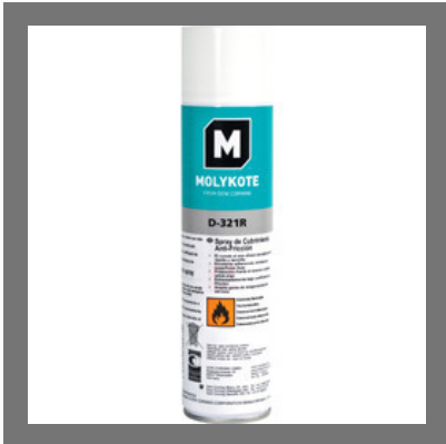
Molykote Lubricant Oil