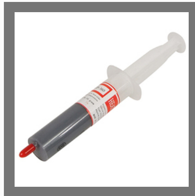
Pre Applied Thermal Paste