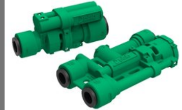
Decentralized vacuum ejectors