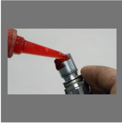
Thread Locking Adhesive