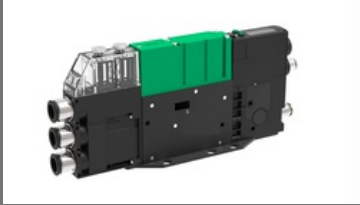
Compact Vacuum Generator