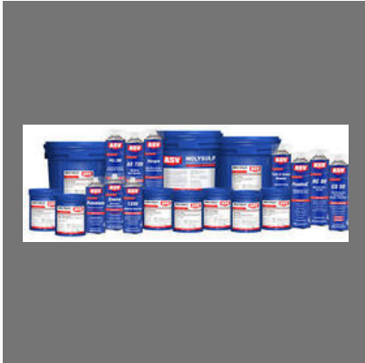
MRO Lubricants / Penetrant Sprays