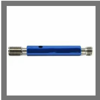
Thread Plug Gauge