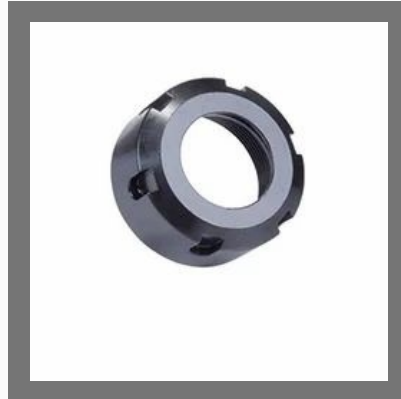
Precision Turned Component