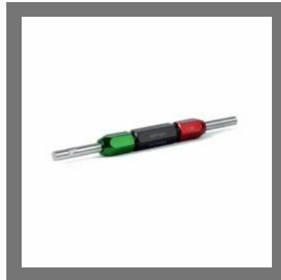
Reversible Plain Plug