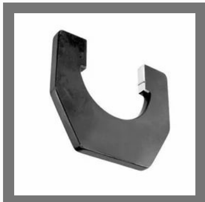
Plain Snap Gauge