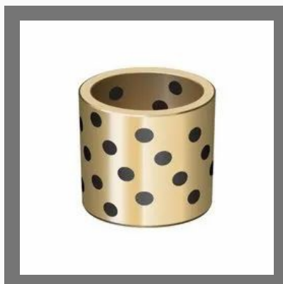
Bronze Oil Less Bushes