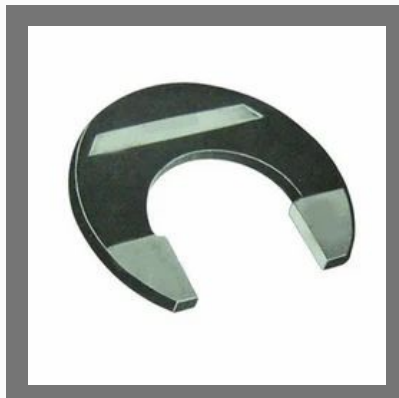
Single Ended Snap Gauge