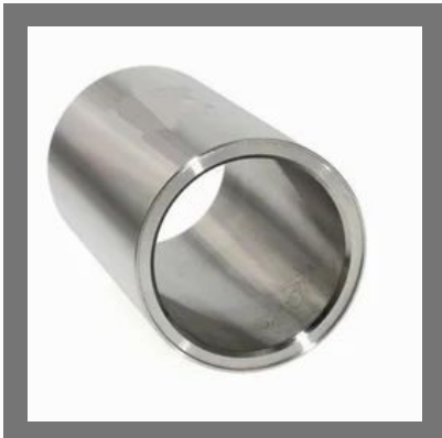
CNC Precision Components