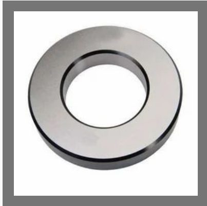
Plain Ring Gauge