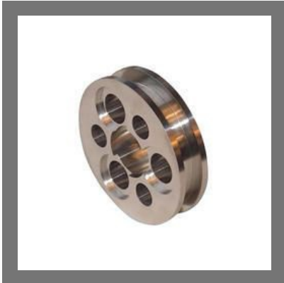
Precision Turned Component