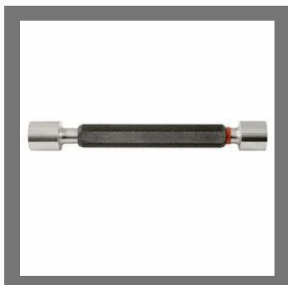
Plain Plug Gauges