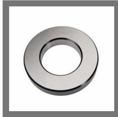
Carbide Ring Gauge