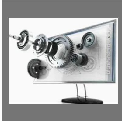
Legacy Data Conversion