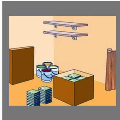
2D And 3D Shapes