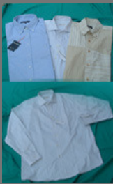
100% Cotton Shirt