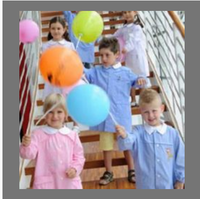
Kids School Dress