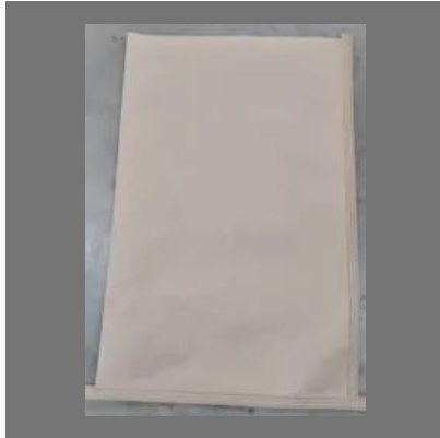
HDPE Laminated Brown L-Stitch Paper Bags