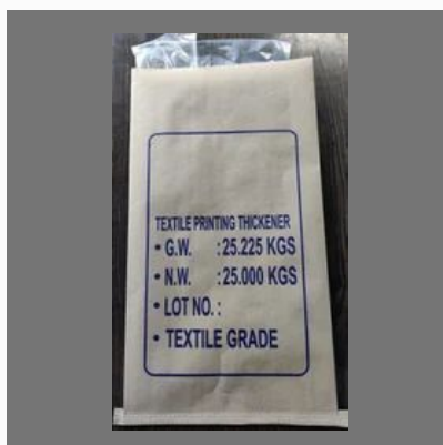
HDPE Laminated Centre Sealed Brown Paper Bag