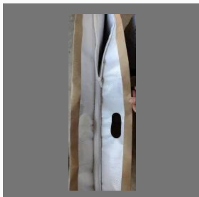
Zipper HDPE Lamination Brown Paper Bag