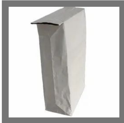
Multiwall Valve Type Paper Bags