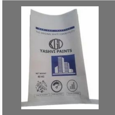
White HDPE Laminated Printed Paper Bag