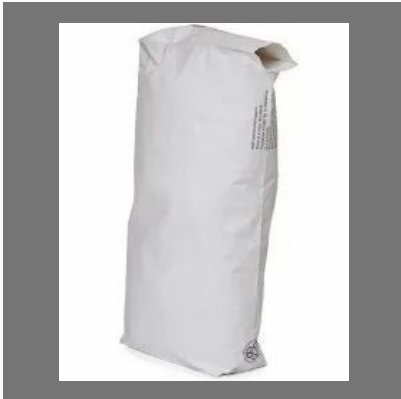
Packaging Multiwall Paper Bags