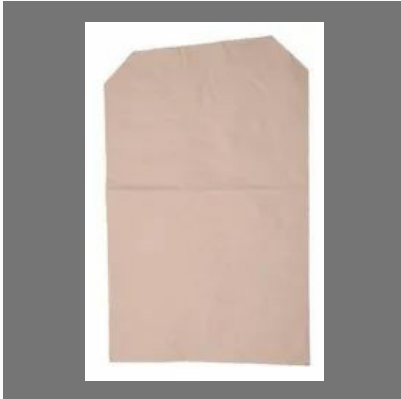
Plain Industrial Valve Type Brown Paper Packaging Bag