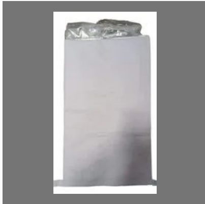
White HDPE Laminated Paper Bags, Storage Capacity: 25-40Kg