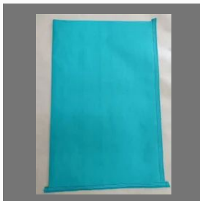
Green HDPE Laminated Paper Bag