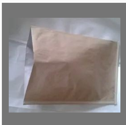
Paper Laminated HDPE Bags