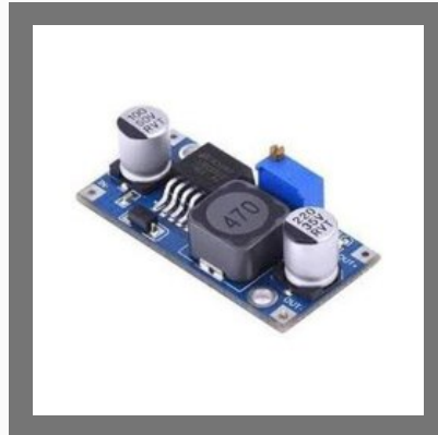
DC To DC Buck Converter