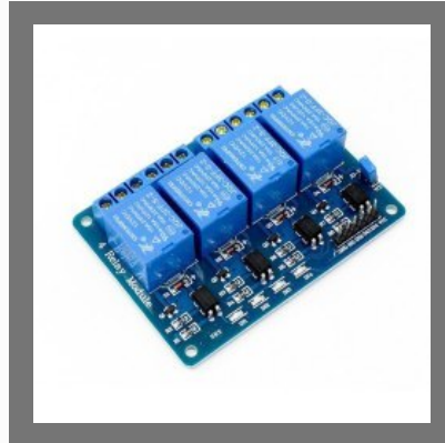
4 Channel Relay Module