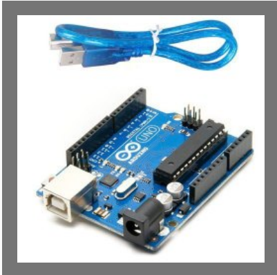
Arduino UNO Development Board