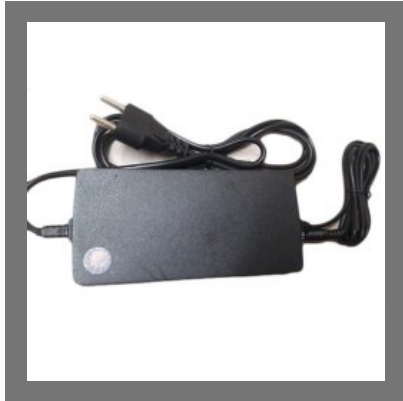
12v 3Amp SMPS Power Adapter