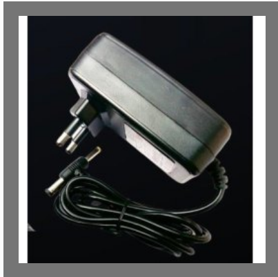
8 VDC Switching Power Adapter