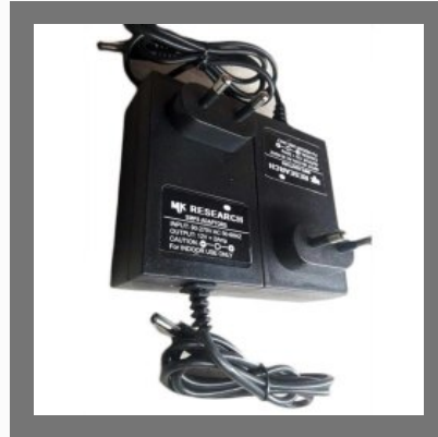
12v 2a Smps Power Adapter