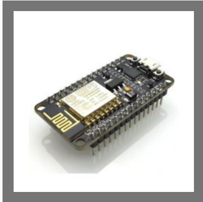
ESP8266 WiFi Module