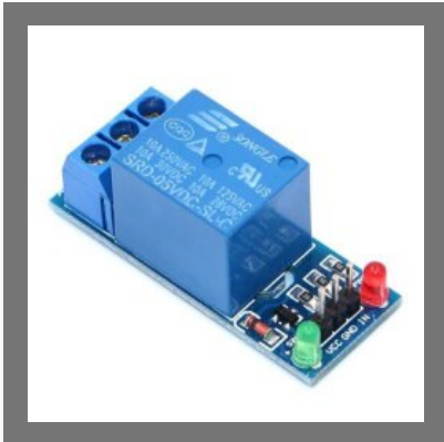
Channel Relay Board