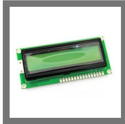
5 VDC LCD Module