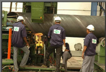
Helical Two Step Technology Service From PSL