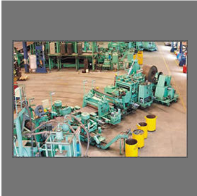
HSAW Pipe Mill From PSL