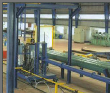
Internal Coating Plants From PSL