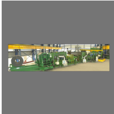
Helical Two Step Technology from PSL