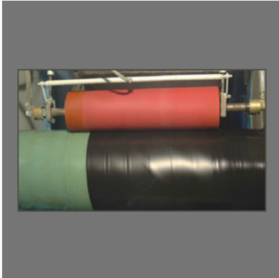
Polyethylene - Pipe Coatings From PSL