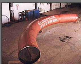
Induction Bends From PSL