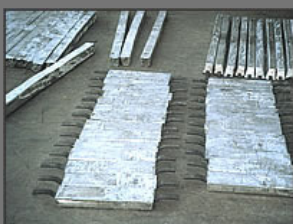
Stand-off Anodes - Sacrificial Anodes From ASL