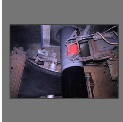
Fusion Bonded Epoxy - Pipe Coatings From PSL