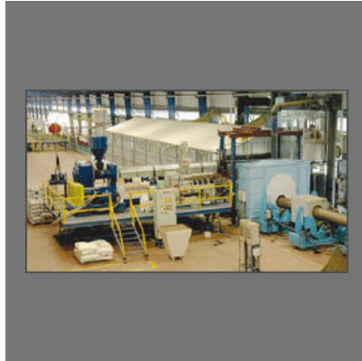
External Pipe Coating Plant from PSL