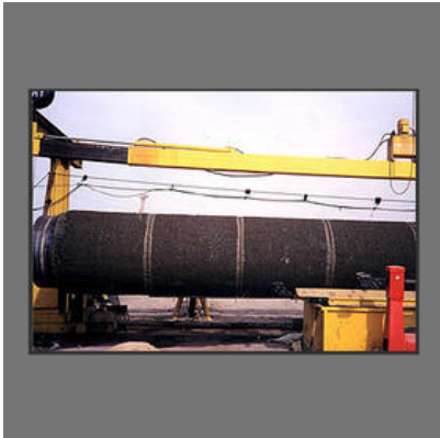
Concrete Weight Coating - Pipe Coatings From PSL