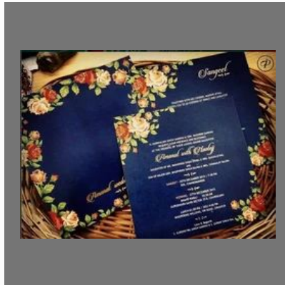
Blue and Roses Wedding Card