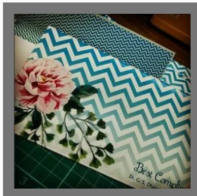
Designer Paper Craft With Rose