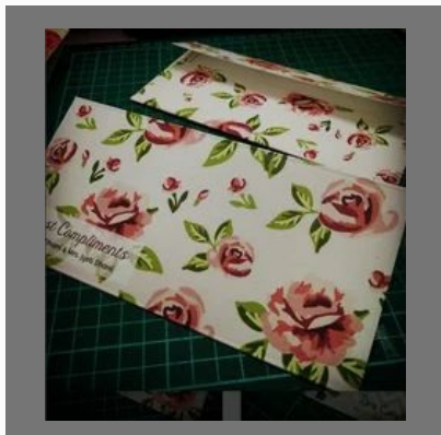
Customised Paper Craft