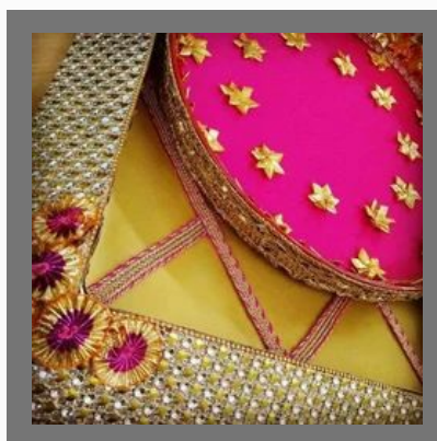
Rani Pink Packaging