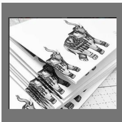
Lovely Elephants Crafts