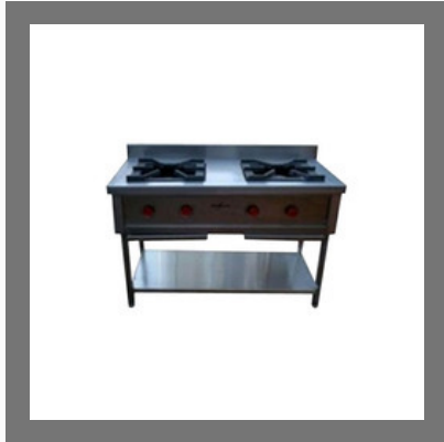
Platform Bulk Cooking Range