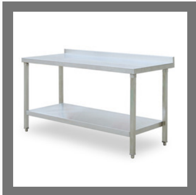
Detachable Working Table