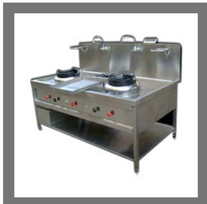
Dome Type Chinese Range