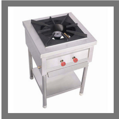
Stock Pot Cooking Range