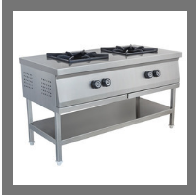
Indian Gas Range