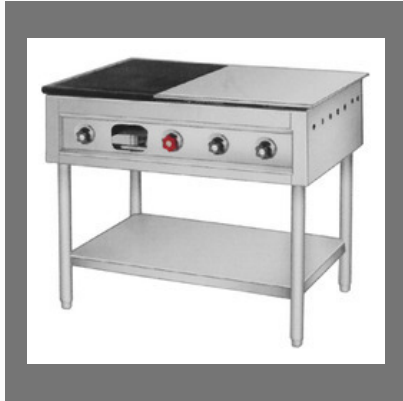
Chapatti Plate with Puffer