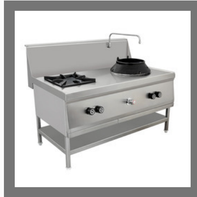
Chinese Gas Range