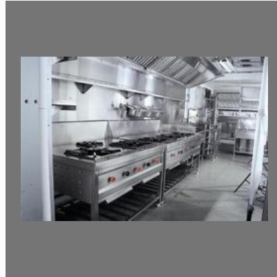
Bulk Cooking Gas Range