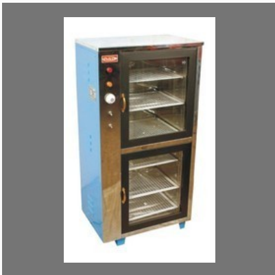
Commercial Food Warmer