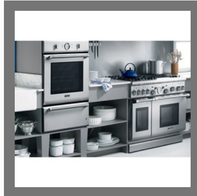
Kitchen Equipment for Canteen