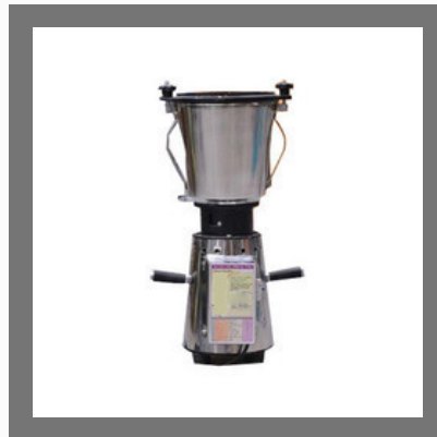
Commercial Mixer Machine