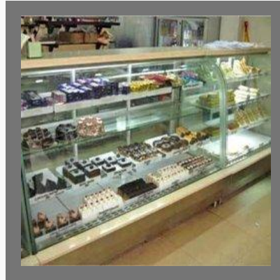
Food Display Counter