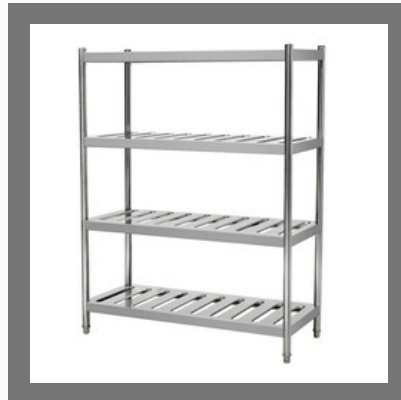
SS Storage Rack