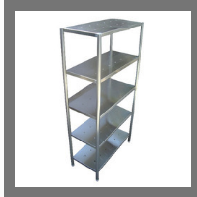
Clean Dish Rack