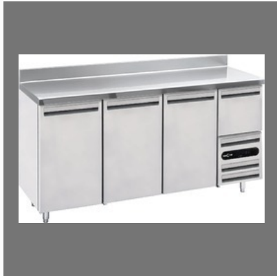
Under Counter Refrigerator