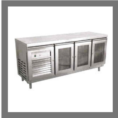
Under Work Counter Refrigerator