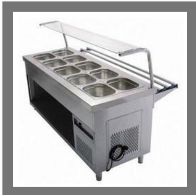
Cold Bain Marie Counter