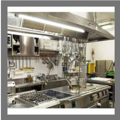
Kitchen Equipment for Hotel