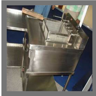
Deep Fat Fryer