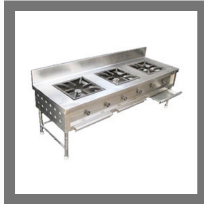
Three Burner Cooking Range