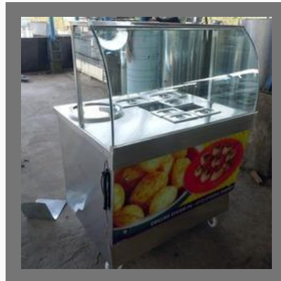
Pani Puri Display Counter