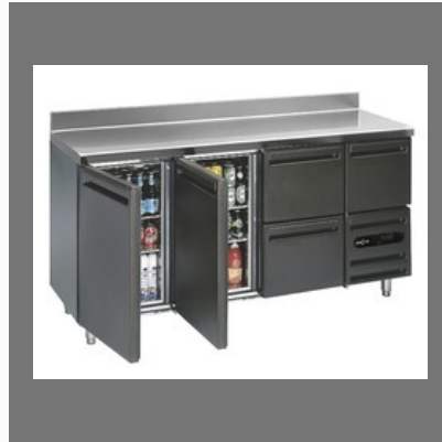
Under Counter Bar Chiller