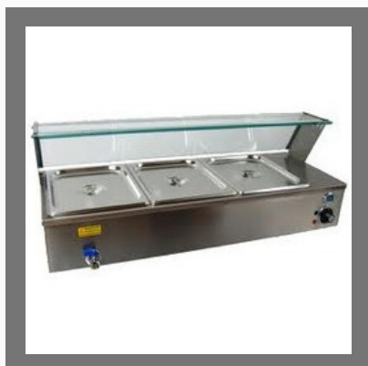
Bain Marie Table Top