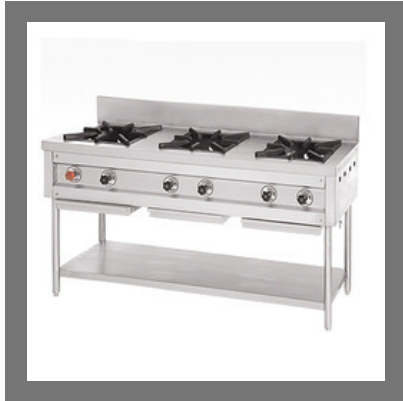
Three Burner Gas Range