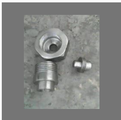
Nut Nipple Gully Set