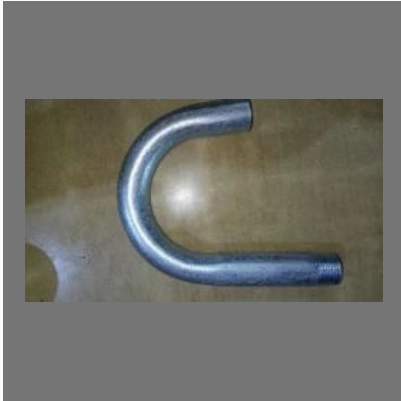
U Band Pipes