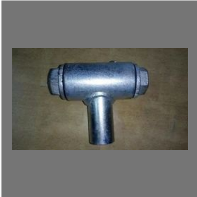
T Valve 40mm