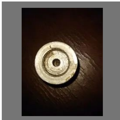
Machinery Parts Bush