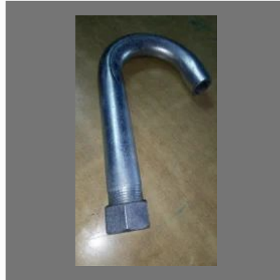
U Band Pipes 3/4 Bsp