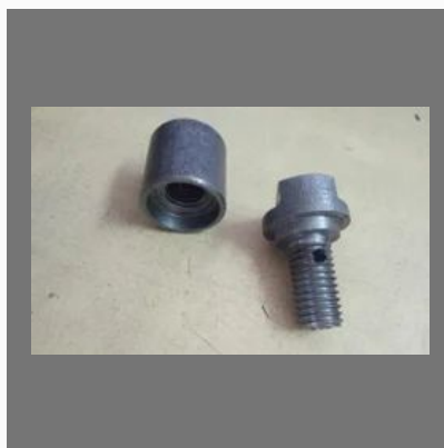
Air Relive Valve