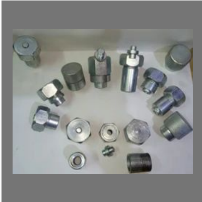
Ct Pt Tank Drain Plug Set