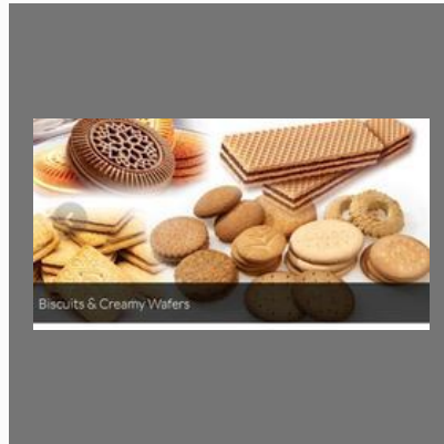
Biscuits Creamy Wafers