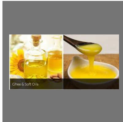
Ghee Soft Oils