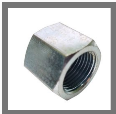
1/2BSP MS Hydraulic Female Dummy