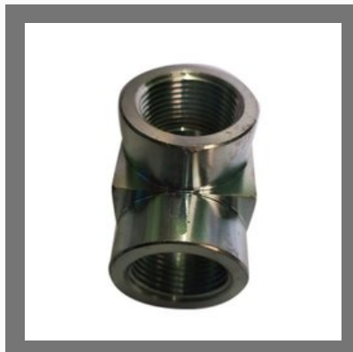
1/2BSP MS Female Elbow