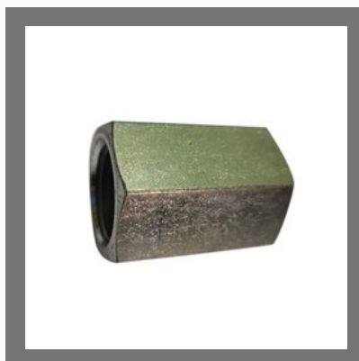
MS Female Coupling