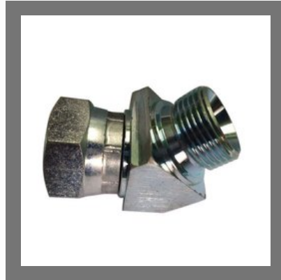
1 Inch Swivel Elbows