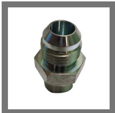
BSP Hex Nipples