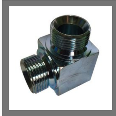
90 Degree Male Elbow