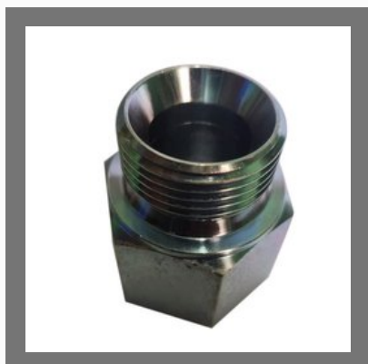
MS Male Female Coupling