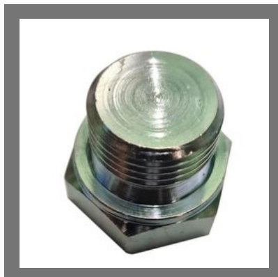
1/2BSP MS Hydraulic Male Dummy