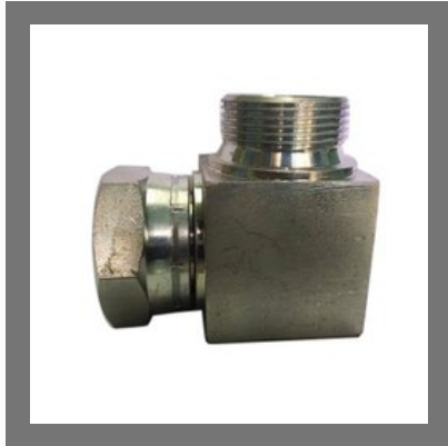
90 Degree Swivel Elbows