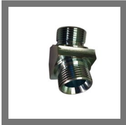
45 Degree Male Elbow