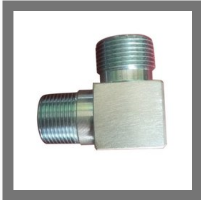
3/8 Inch Male Elbow