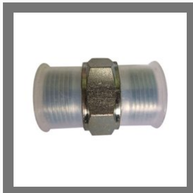
Hydraulic Hex Nipple