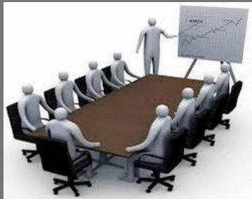
IT Training Service