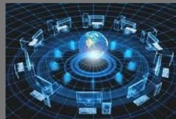
Business Service Management