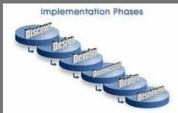
Process Implementation Services