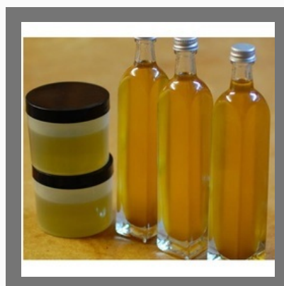
Cardamom Seed Oil