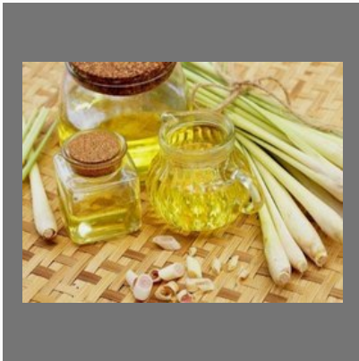
Lemongrass Leaf Oil