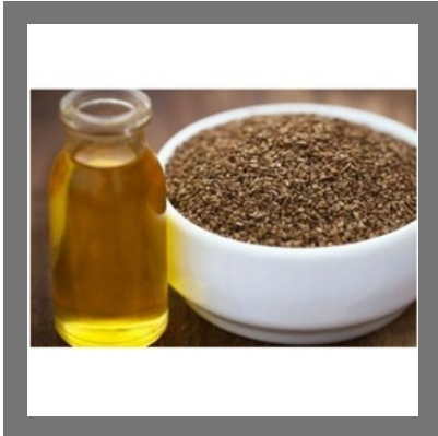
Ajowan Seed Oil