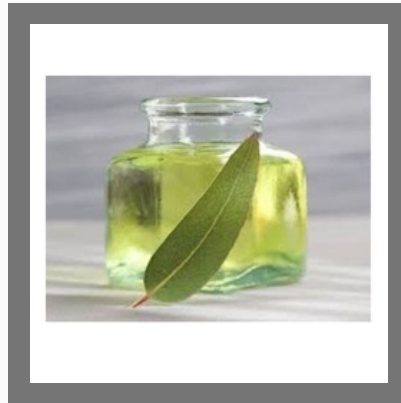
Eucalyptus Leaf Oil