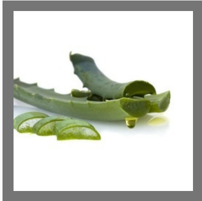
Aloe Vera Extract