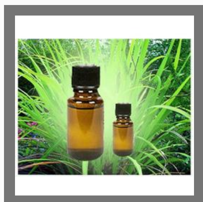
Palmarosa Essential Oil