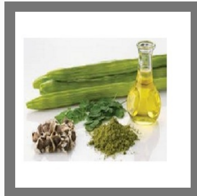
Moringa Oleifera Extract