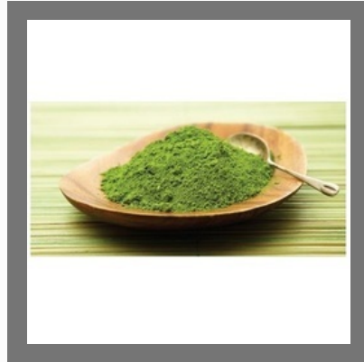
Green Tea Extract