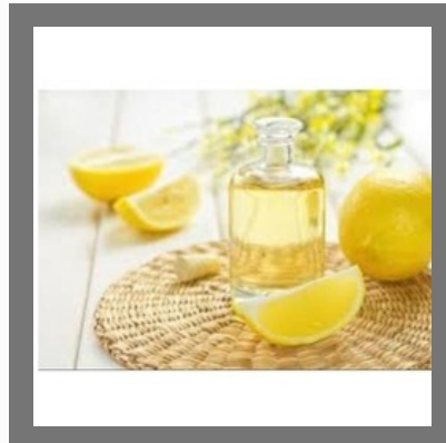
Lemon Seed Oil