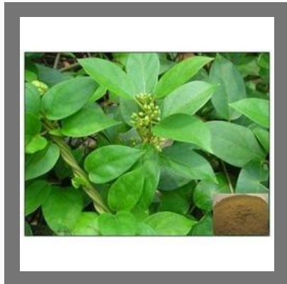
Gymnema Sylvestre Extract