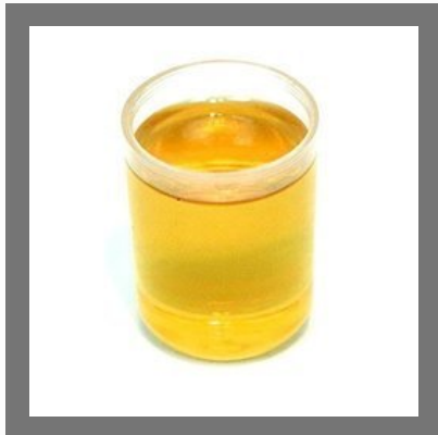
Tagetes Essential Oil