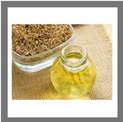
Cumin Seed Oil