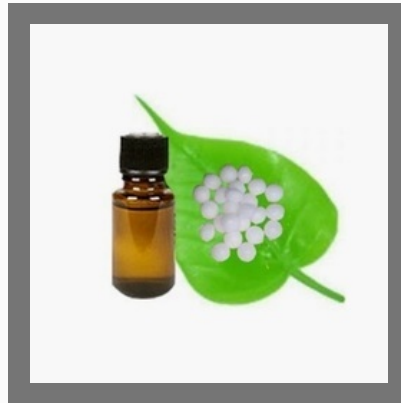
Camphor Leaf Oil