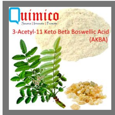
Boswellia Serrata AKBA