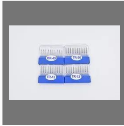
Dentmark Diamond Bur Kit (Set Of 5 Pcs)