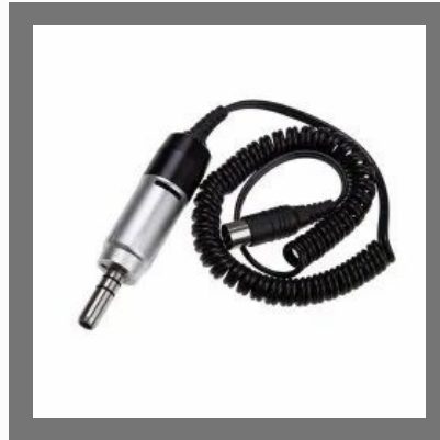
Dentmark E- Type Clinical Micromotor