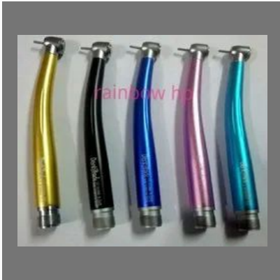
Dental Hand Piece