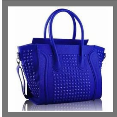
Leather Ladies Bag