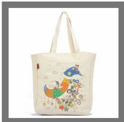
Ladies Cotton Bag