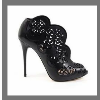
Ladies Leather Sandal