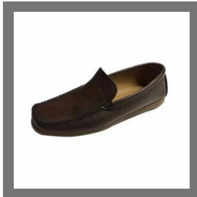
Leather Loafer Shoes