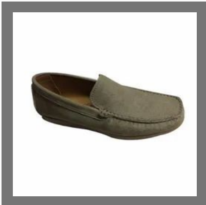
Men's Loafer Shoes