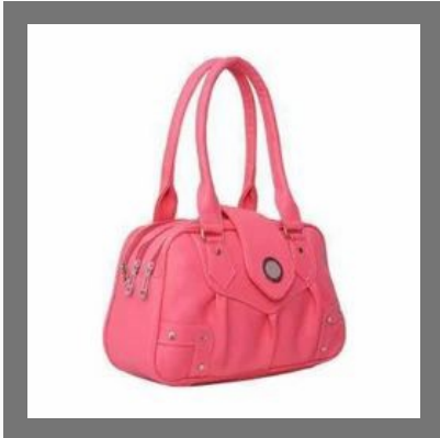
Designer Ladies Bag