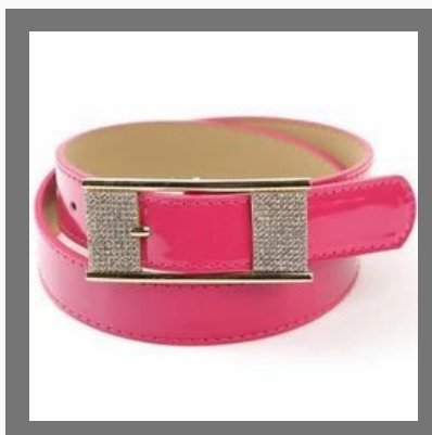
Ladies Leather Belt