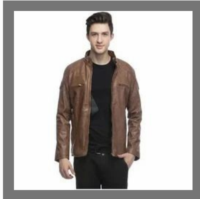
Men's Brown Leather Jacket