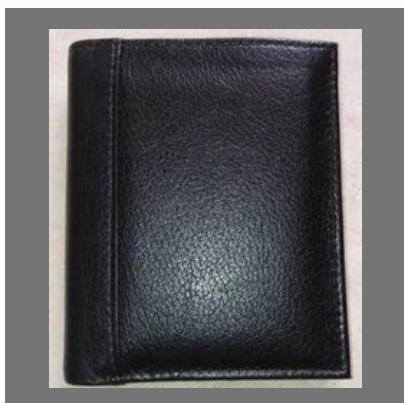
Mens Leather Wallets