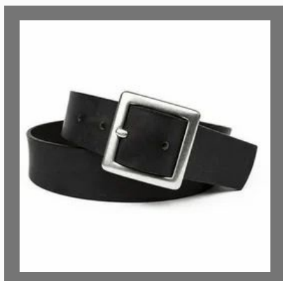
Men's Leather Belt