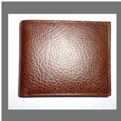
Mens Leather Wallets