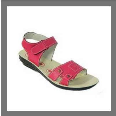
Ladies Flat Sandal