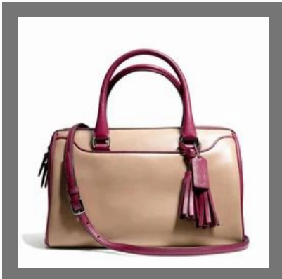
Ladies Fashionable Bag