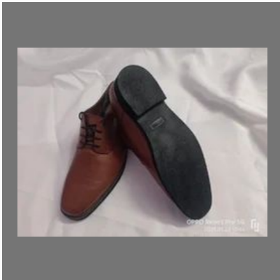
Mens leather shoes