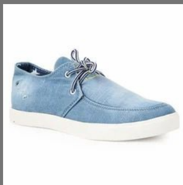
Men's Sneaker Shoes