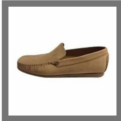
Casual Loafer Shoes