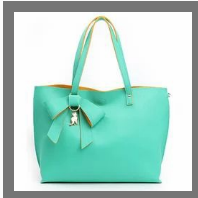
Ladies Shoulder Bag