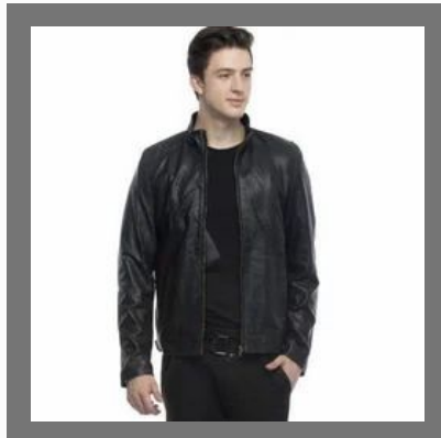
Men's Black Leather Jacket