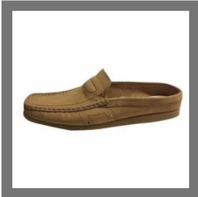
Designer Loafer Shoes