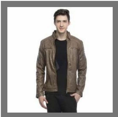
Men's Designer Leather Jacket