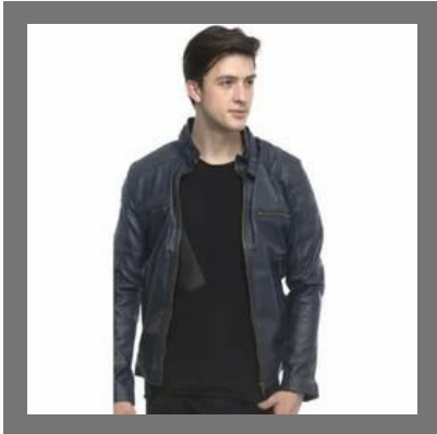
Men's Fancy Leather Jacket