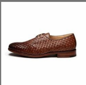
Men's Woven Shoes