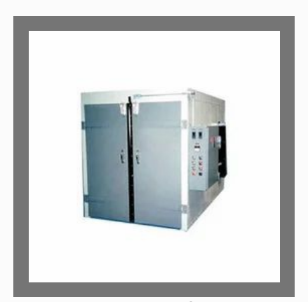
Industrial Heating Oven