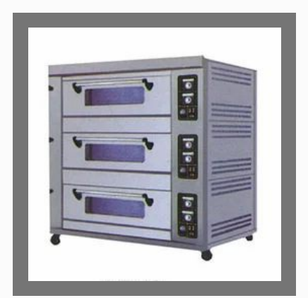
Industrial Digital Oven