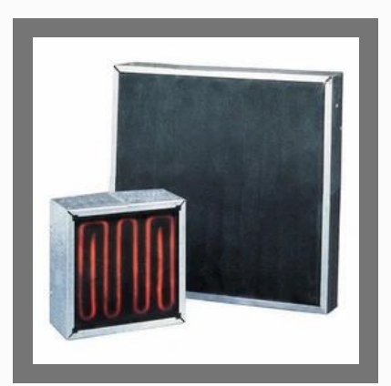
Solar Heater Panels