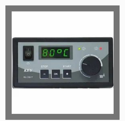
Temperature Controlling Device