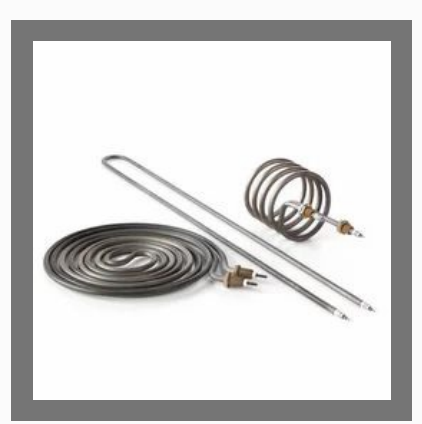
U Type Tubular Heater