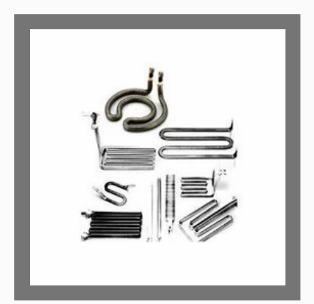
Electric Tubular Heater