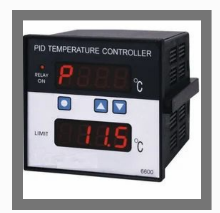
Omron Temperature Controlling Device