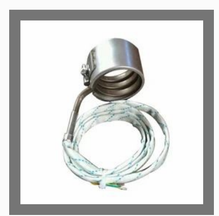
Spiral Coil Heater