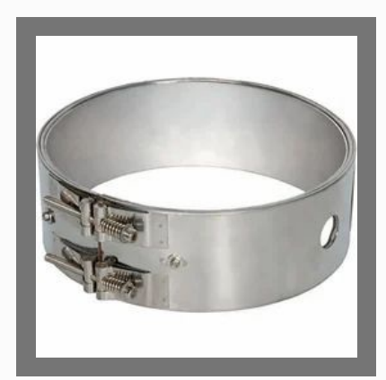
Electric Band Heater