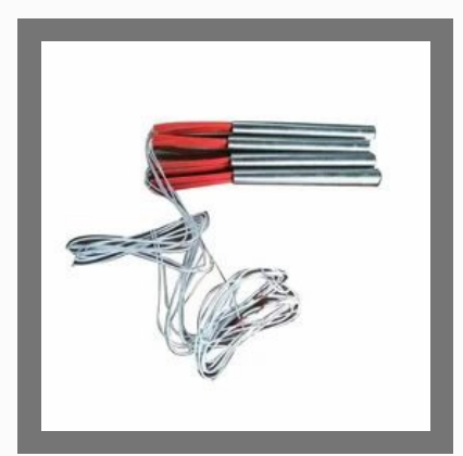
Ceramic Cartridge Heaters