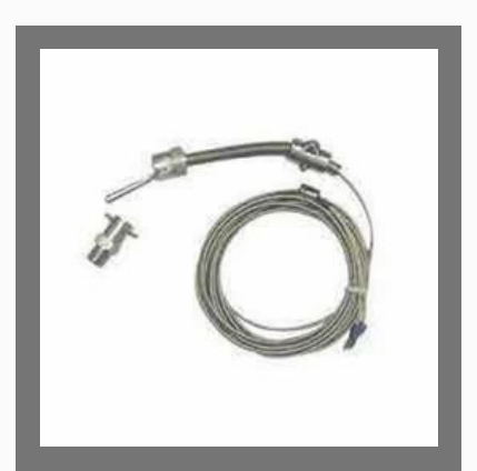
J Type Thermocouples