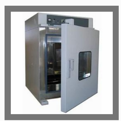
High Density Industrial Oven