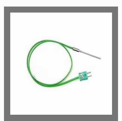
K Type Thermocouple