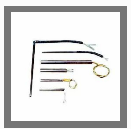
High Density Cartridge Heaters