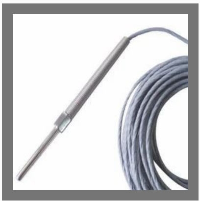
PT100 Thermocouple Sensor