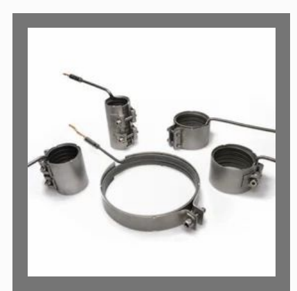
Electric Coil Heater