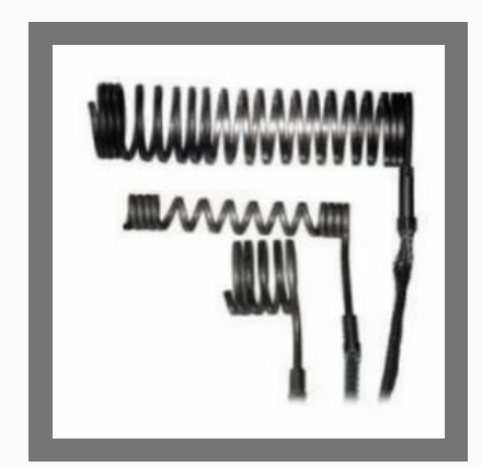
Industrial Coil Heater