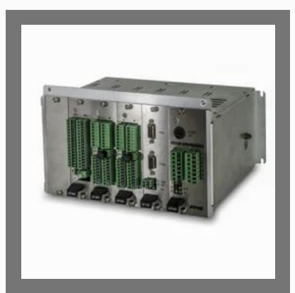
Fuji Temperature Controlling Device