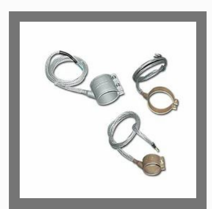
Electric Catridge Heaters