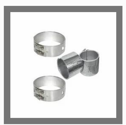
Mica Band Heater