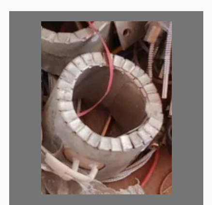
Temperature Control Device