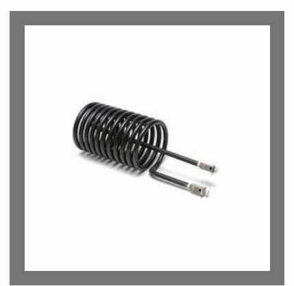
Tabular Air Heater