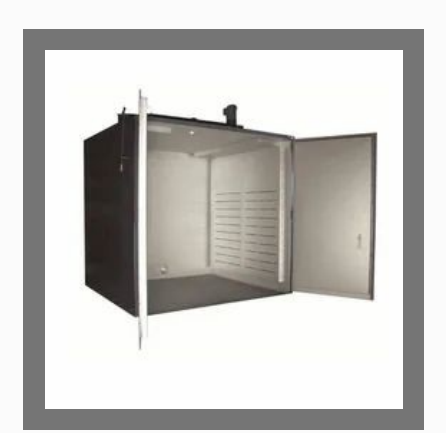
Electric Industrial Oven