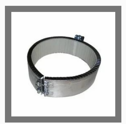
Aluminium Band Heater