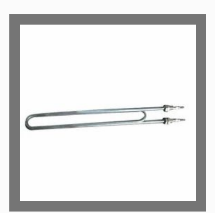
Ceramic Tubular Heaters