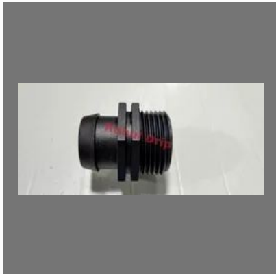
32mm Rain pipe Adapter