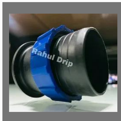
40mm Rain Pipe End Cap