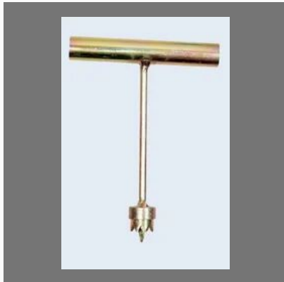
Drip Irrigation PVC Drill Bit