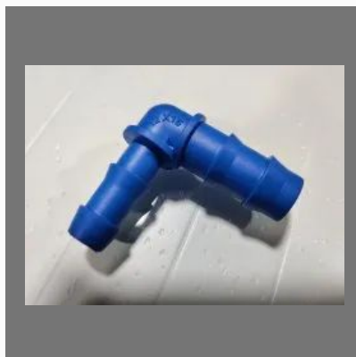
12 x 16 Elbow