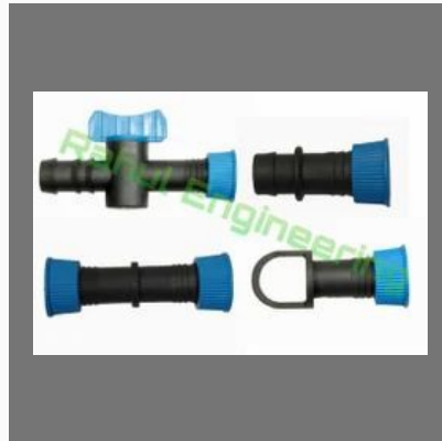
Pepsi Drip Irrigation Systems