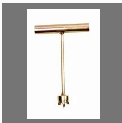
PVC Drill Bit