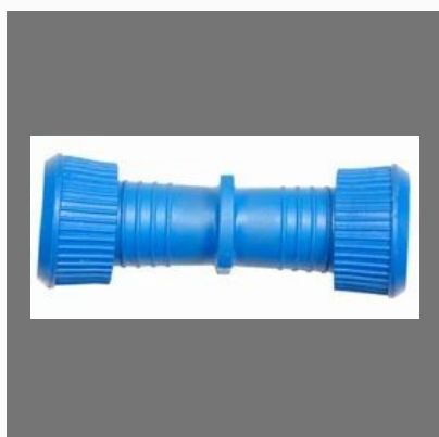
20mm Pepsi cap Joiner