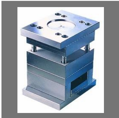
Online Dripper Moulds