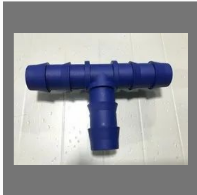
16 mm Tee