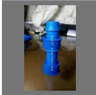
16mm Pepsi Joiners