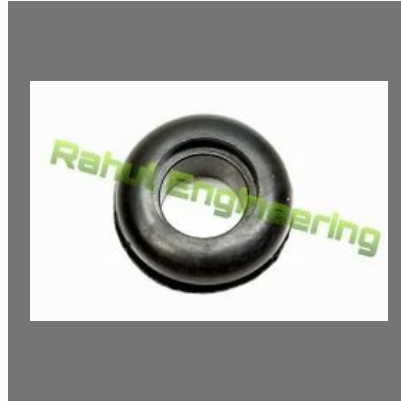
16mm Rubber Grommet