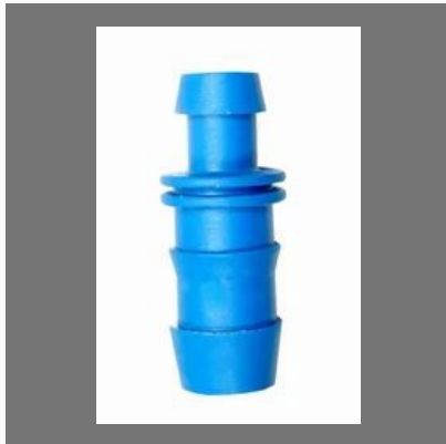
20x16mm Take Off