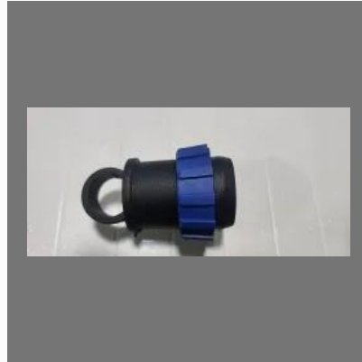
32MM RAIN PIPE ENDCAP