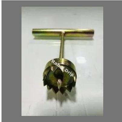
Drill Bit 32 Mm