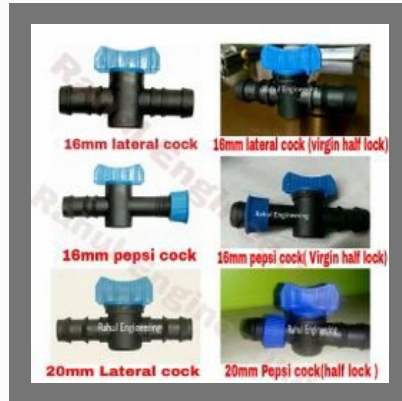
16mm Lateral Cock