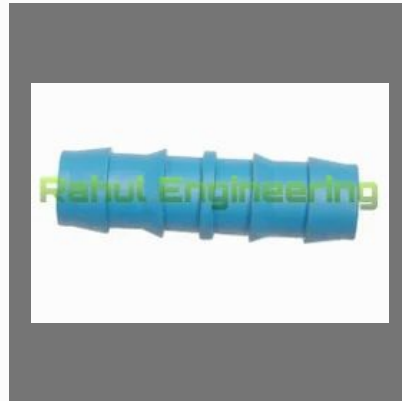
20 mm Joiner