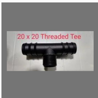
20mm Threaded Tee