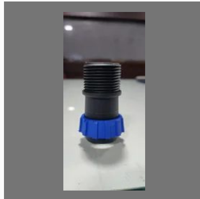
32mm Rain Pipe Takeoff MTA