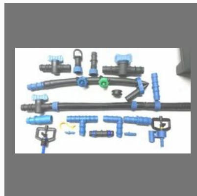
Drip Irrigation Equipment