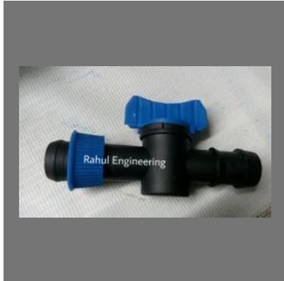
16mm Pepsi Cock