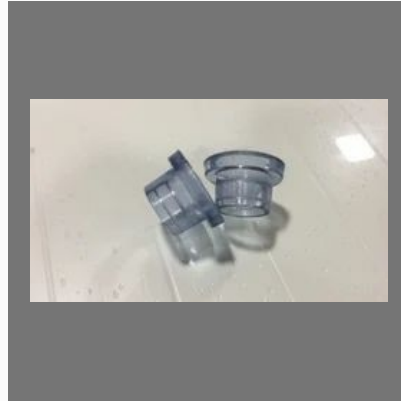
16mm Neta Grommet