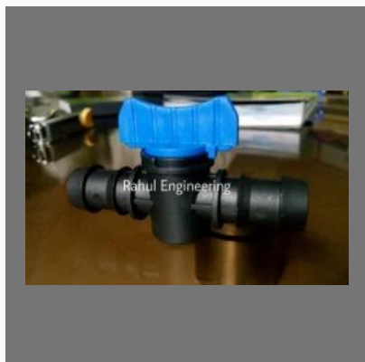
16mm Lateral Cock