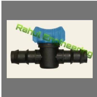
20mm Lateral Cock