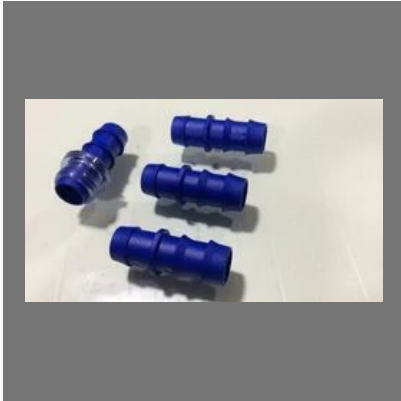
16mm Neta Take Off