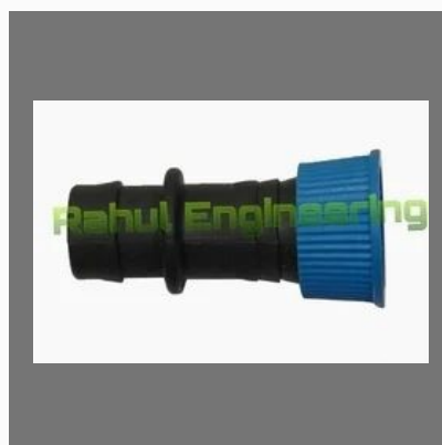
16mm Pepsi Take Off