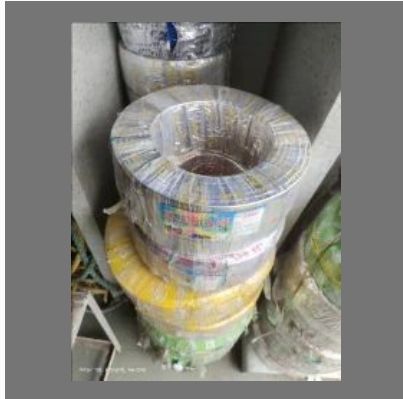
Kisan Wire Cable