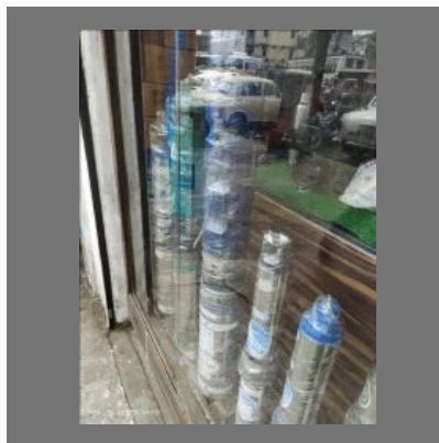
Submersible Water Pupm