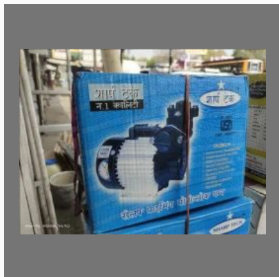
Sharp No 1 Pupm