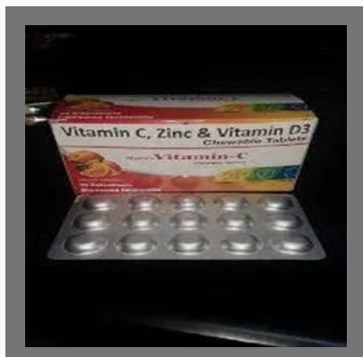
Vitamin C D & Zinc tablet