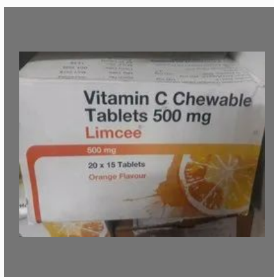
Vitamin C Chewable Tablets 500mg