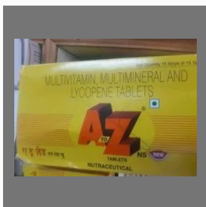
A To Z Tablet