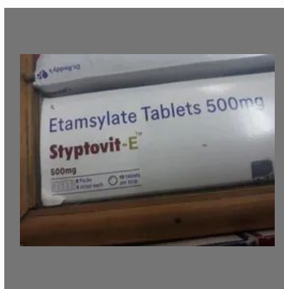
Etamsylate Tablets 500mg