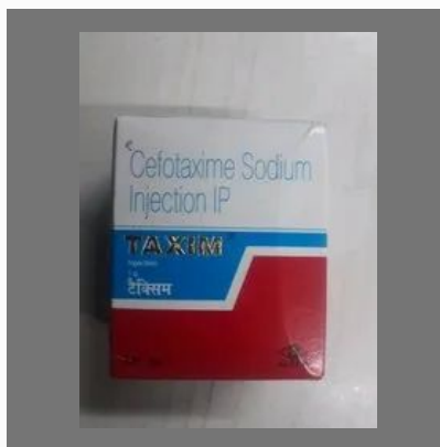
Cefotaxima Sodium Injection IP