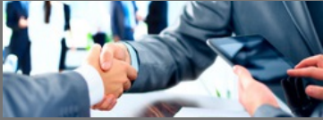
Tax Planning Service