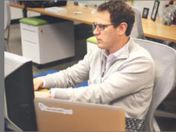
Self Employee Tax Preparation