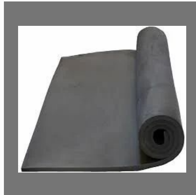
Cellular Polyethylene Sheets