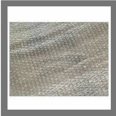
Air Bubble Film