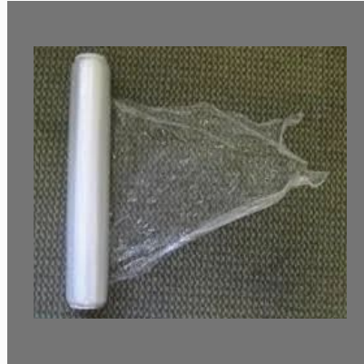
Cellular Polyethylene Sheets