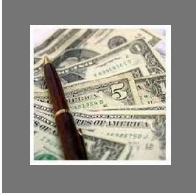
Project Financing Consultancy Services