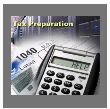
Income Tax Services