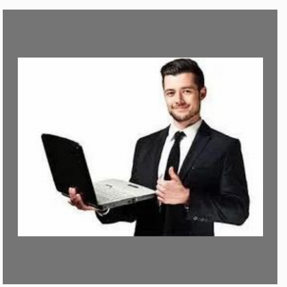
Online Company Formation Services