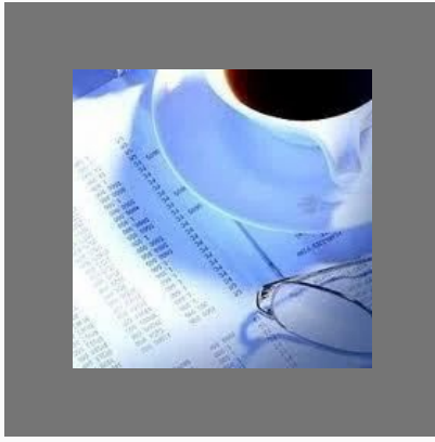
Stock Audit Assurance Services