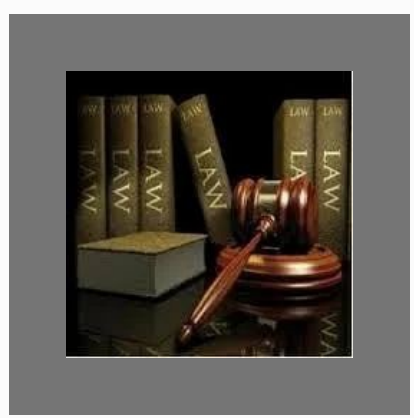
Company Law Consultancy Services