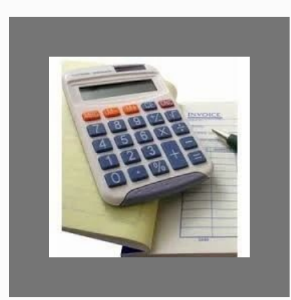
Taxation Advisory Services