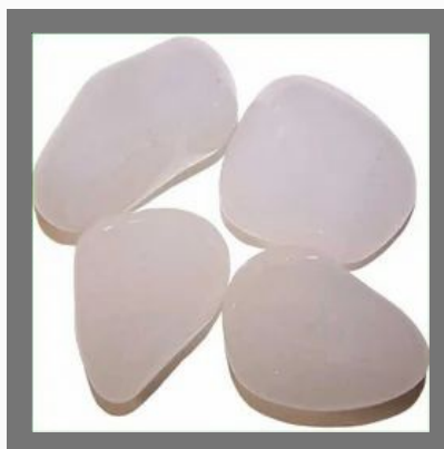
Quartz Pabbles Milky