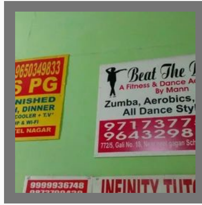
Flex Board Printing Service