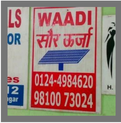
Safety Sign Board