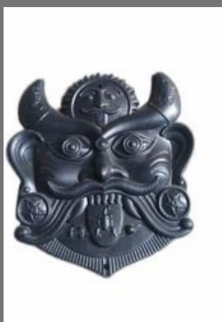
Demon Face Plastic Mold