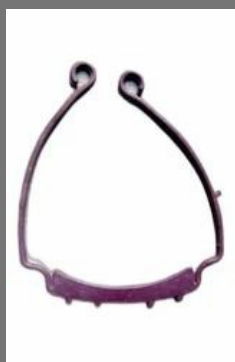
Die Molds Manufacturer