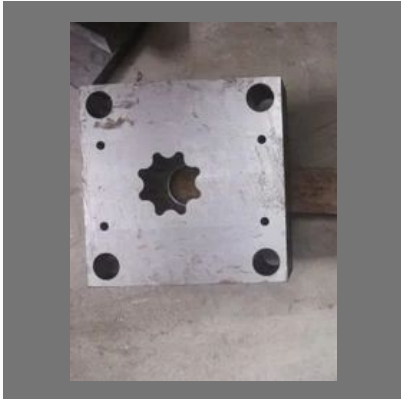
Precision Vmc Job Work