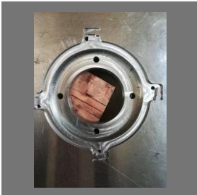
Precision Vmc Job Work