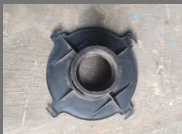
Black Plastic Mould