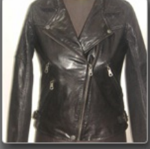
Women's Fashion Wear