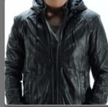
Men's Fashion Wear