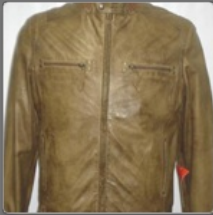
Men's Fashion Wear