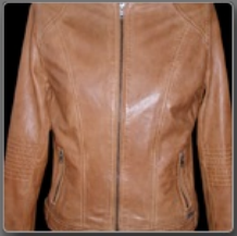
Women's Fashion Wear