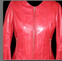
Women's Fashion Wear