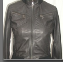
Women's Fashion Wear