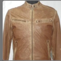
Men's Fashion Wear