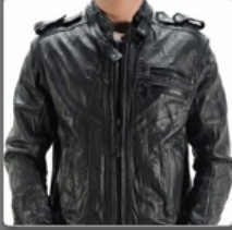
Men's Fashion Wear Jackets