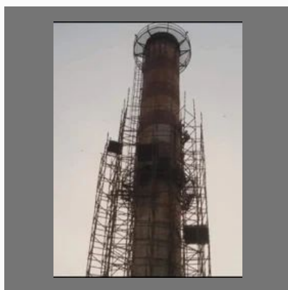
Old Building Demolition & Dismantling Work in Delhi, Noida, Gurugram, Faridabad, Ghaziabad