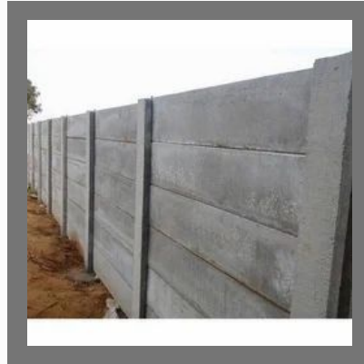
RCC Cumpaund Wall Construction Work Services