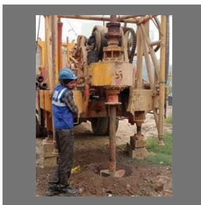
Boring Work in Delhi