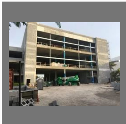
RCC Building Construction Services in Delhi, Noida, Gurugram, Faridabad, Ghaziabad