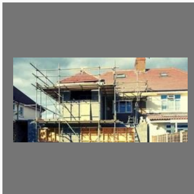
Residential, House, Home Construction Work Services in Delhi, Gurugram, Noida, Faridabad, Ghaziabad