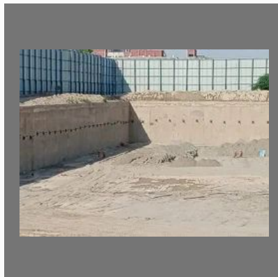
Diaphragm Wall Service in Delhi, Noida, Gurugram, Faridabad, Ghaziabad