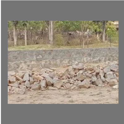
Rock Cumpaund Wall Construction Services in Delhi, Noida, Gurugram, Faridabad