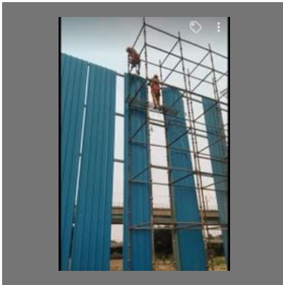
Barricading Fabrication For Construction Site Work Service in Delhi, Noida, Gurugram, Faridabad