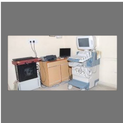
Cardiological Check-Up Facility