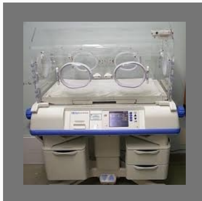
Premature Baby Incubator Facility