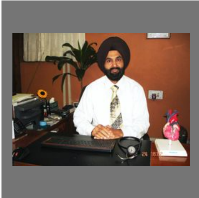
Consultant Noninvasive Cardiologist